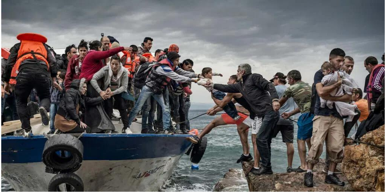
Is Europe's Refugee Crisis Is a Crisis of Humanity, not Migration or Economic Survival?