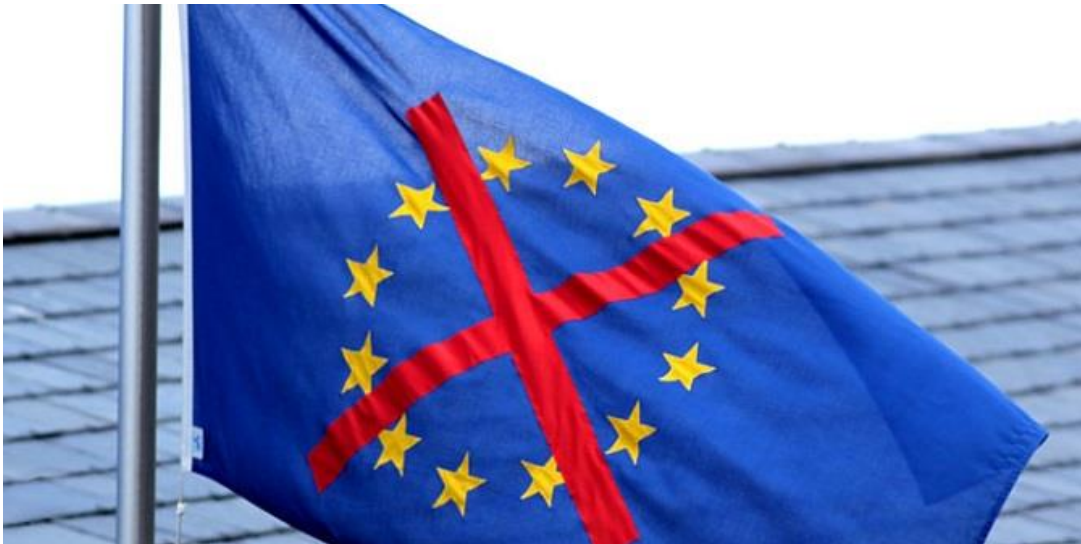
Anti-European Union Protest Flag

Veronica Marcone The America-Eurasia Center US-European Program www.eurasiacenter.org