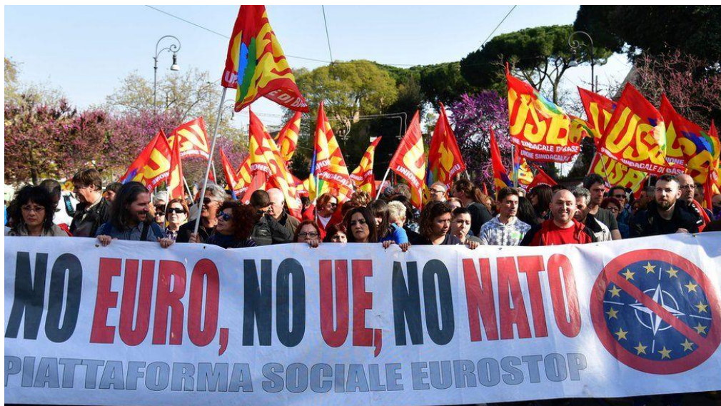
In Rome, anti-European Union protestors show dissatisfaction during anniversary support for the EU.

Italy has recently had elections which resulted in the victory of the centre-right coalition, most parties of which have shared a somewhat anti-European stance in the past. An increasing number of Italians, even more following the pandemic, have seen the EU as the cause of internal problems and that the introduction of the Euro in the country was detrimental to the economy. ( Berti, 2020 )