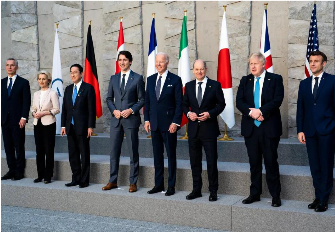
Leaders of the G7 nations agreed to provide nearly $20 billion in aid to Ukraine in May 2022.

The West should seize a sizable but not extraordinary amount of frozen Russian currency reserves and put them towards directly assisting affected Ukrainians as part of a reparations package separate from any post war peace agreement. The damage Russia has caused the Ukrainian people through its illegal and unprovoked invasion does warrant continued financial punishment and using frozen Russian currency assets to compensate for these damages is just, prudent, and necessary. However, most of the currently frozen reserves should remain frozen and subject to possible return to Russia provided Russia agrees to conditions set forth by the West and Ukraine as part of an ultimate settlement agreement. The West can properly hold Russia accountable, provide Ukraine with the support it requires, and preserve the invaluable status of the dollar as the world's primary reserve currency.