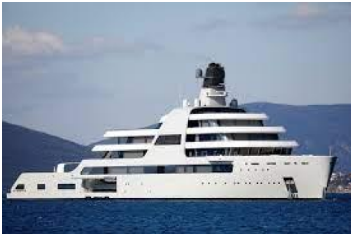
A yacht connected to Russian oligarch Roman Abramovich sails off the coast of Montenegro.

Foreign currency reserves are not the only Russian assets some have proposed using to fund Ukrainian reconstruction efforts. In April of 2022, the U.S. House of Representatives passed the “Yachts for Ukraine Act”, which urges the Treasury Department to auction off seized assets of Russian oligarchs valued over $5 million and donate the proceeds to humanitarian efforts in Ukraine. 5 While a well-intentioned idea, the process of seizing and then auctioning off assets is often a difficult and arduous one, fraught with legal and logistical challenges that delay the eventual delivery of much needed aid. Seizing currency reserves solves many of those challenges thanks to their inherent liquidity. By confiscating Russian hard currency reserves, the West can transfer billions of dollars, euros, and pounds directly to Ukrainian hands without the need for auctions.