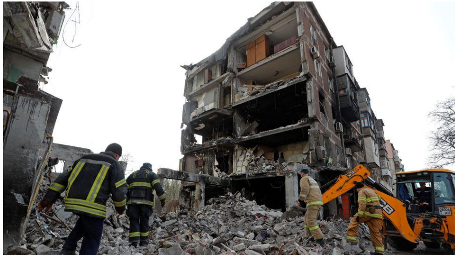
Rescuers work at a residential building damaged by Russia during Ukraine-Russia conflict in Mariupol, Ukraine.

Christopher Trzaska The America-Eurasia Center www.EurasiaCenter.org