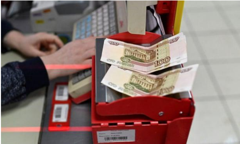
100-ruble notes sit on the counter of a cashier's desk in Russia.

On February 24, 2022, the transatlantic security environment changed forever with Russia's brutal and unprovoked invasion of Ukraine. As missiles struck across the country and thousands of troops poured in from all sides, it rapidly became clear that the war would be more destructive, deadly, and expensive than any European conflict since 1945. In response to the invasion, the West imposed a series of crippling economic sanctions on Ukraine. One of the most impactful actions the West took was freezing Russia's foreign currency reserves, essentially preventing the Russian government from accessing hundreds of billions of dollars of its own money held in Western banks. While many have argued that the West should use these frozen assets to fund Ukraine's extensive recovery, such a move would likely undermine the global financial system. Thus, a more nuanced approach is needed that balances Ukraine's needs with the responsibilities that come with controlling the world's primary reserve currency.