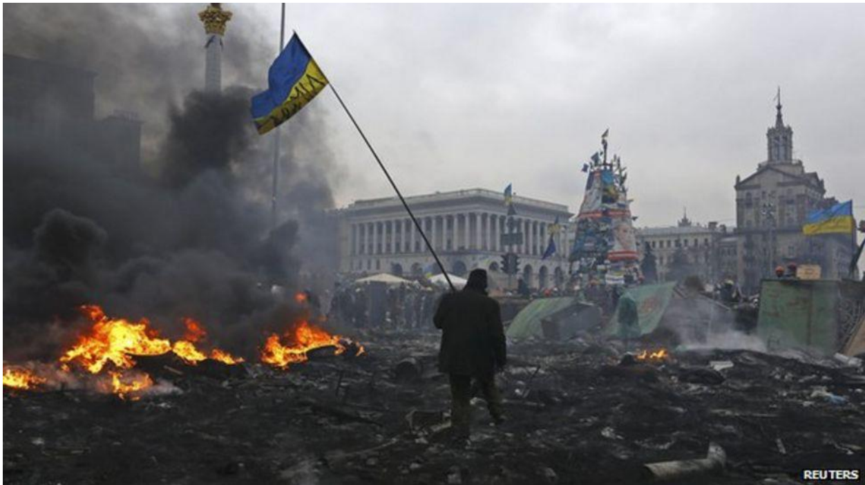
The World Bank estimates staggering $349 billion costs for rebuilding and recovery in Ukraine. This picture of the Maidan Revolution 2014.

biting Western economies at a level not seen in decades and political populism makes extended financial commitments to foreign countries politically untenable, the West will need to get creative to fulfill its promises to Ukraine. Russia's frozen currency reserves offer an appealing avenue that enables the West to meaningfully assist Ukraine in its recovery while also ensuring pressing domestic needs are not left unfulfilled.