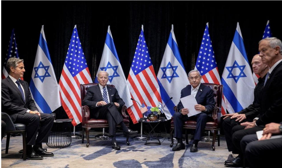
President Biden meets with Israeli Prime Minister Benjamin Netanyahu in Tel Aviv, Israel

ranking officials and civilians alike, Biden has announced new sanctions against Hamas leaders and is seeking $105 billion security package that includes $10.6 billion in an emergency funding package to support Israel. 7 He has voiced concerns over an escalation in the Levant, cautioning the Israeli government against a long-term Gaza occupation in response to Israeli Minister of Defense Yoav Gallant's promise of "the total annihilation of Hamas Organization." He also has publicly acknowledged and emphasized that the "vast majority of Palestinians are not Hamas." 8