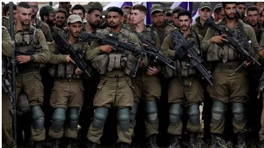
Israeli soldiers lined up in a field near the border of the Gaza Strip.

War between Israel and Hamas Continues as Gazans are Forced to Flee their Homes