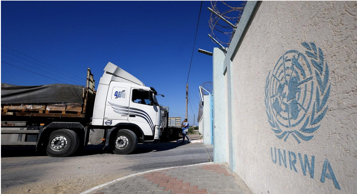
An aid truck arrives in Gaza on October 21

Since the initial attack from Hamas, the Islamic militant group that killed over a thousand Israelis on October 7, the Israel Defense Forces (IDF) and Israeli government have continued to attack Gaza through airstrikes, with a ground strike predicted to happen soon, although the exact timeline is uncertain. Since October 7, the total death toll is almost 5,000 killed: 3,478 in Gaza, 69 in the occupied West Bank, and 1,400 in Israel. 1 In addition, there have been 12,065 others wounded in Gaza, 1,300 in the West Bank, and 3,800 in Israel. 2 This war has become the deadliest in both the Israeli and Palestinian history since Israel's establishment in 1948. Over one million Gazans have been displaced by the destruction of homes and critical infrastructure and the Israeli government's request to evacuate in the northern part of Gaza. Aside from this call to leave the north by the Israeli government, airstrikes continued across the entirety of Gaza,