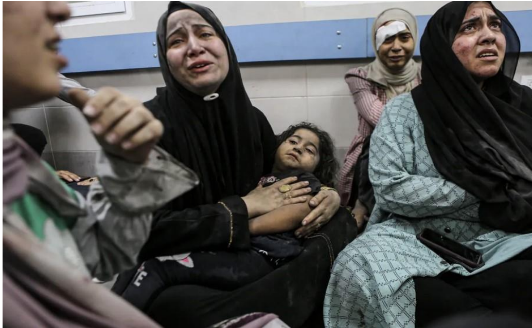
Women and children wounded and grieving after a hospital blast, killing 500 Palestinians, Gaza City