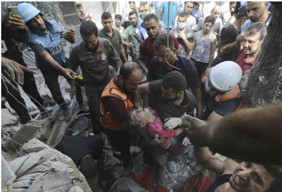
Palestinians rescue a child found under rubble after an Israeli airstrike in Gaza City

While President Biden was in the Levant, he was supposed to meet with Palestinian Authority President Mahmoud Abbas. However, Abbas reportedly canceled the meeting, communicating that the situation is intensifying and few available diplomatic paths are now collapsing. Linda Robinson, a senior fellow at the Council on Foreign Relations, stated that “the U.S. signaling has been very heavily pro-Israel, and they have only been moderating it with the need to protect civilian Palestinians in recent days,” she added, “What [strategy] is happening is not working.” 10