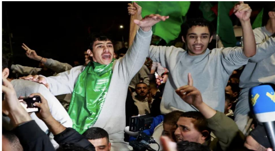
Palestinians celebrating the released prisoners.

All of the hostages and their stories that have been described here are faced with "a range of layered psychological impacts including anxiety, depression, disorientation, grief, post-traumatic stress and survivor's guilt, experts say." 9 As of December 1st, according to Israel, there are still 137 hostages in Gaza that need to be freed. 10 It is presumably for this reason that Israel has begun to continue its aerial bombardment and ground invasion of Gaza, as Israel has stated before that should Hamas stop its release of hostages, attacks will resume in order to pressure them into doing so. Hamas has countered by stating that some of the hostages are being held by other groups and has previously expressed a willingness to continue the ceasefire to allow for the release of male hostages and soldiers. 11 It should be noted, however, that Hamas would force Israel to make a very significant concession in exchange for freed soldiers. 12