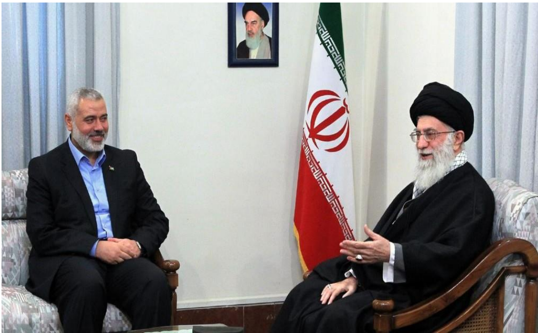
Iran's Supreme Leader Ayatollah Khamenei meets with Hamas Leader Ismail Haniyeh, 2014

not have direct involvement with these attacks, they are certainly going to take the opportunity to use this devastating situation to their advantage and have done so by claiming these attacks are a warning to Arab nations seeking to normalize ties with Israel. In a call to the Syrian foreign minister on October 9, a senior aide to Khamenei, Ali Akbar Velayati said, “those Arab countries who wish to establish diplomatic relations with the Zionist regime must now take a lesson from what has happened and think twice before doing so.” In an eerie end to the conversation he added, “they are pursuing futile plans.” 9