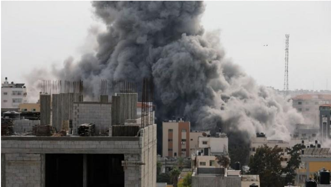
Damage from Hamas rockets in Israel, Photo Credit: Reuters.

In what is undoubtedly going to go down in history as one of the darkest days for the people of both Israel and Palestine, Hamas has launched a full-scale war against Israel, damaging Israeli cities with rockets, murdering civilians, taking hostages, and making threats. In retaliation for the horrendous loss of life, Israel has fought back, sending a barrage of rockets down on Gaza, hitting not only Hamas targets but government and university buildings, infrastructure, and a police station. 1 Israel has also put into place a total blockade on all goods going in and out of Gaza, an action which the United Nations' Human Rights Chief condemns as illegal under international humanitarian law. 2 Israel claims to have secured its border after three days of clashes but it does not seem likely that Hamas is willing to back down anytime soon. 3 What is entirely evident, as death tolls on both sides soar is that the people who are suffering the full weight of this violence are civilians, both Palestinian and Israeli.