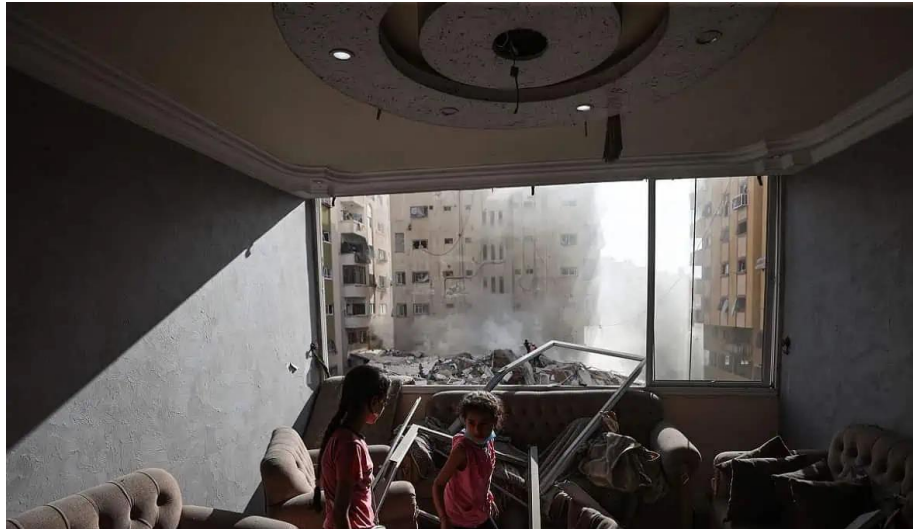
Children in their damaged apartment in Gaza following Israeli airstrikes on Saturday, October 7, 2023