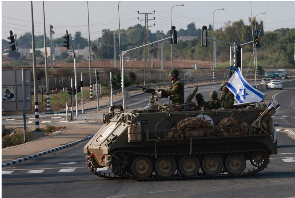
Israeli forces are deployed near Sderot at the southern border, Photo: Menahem Kahana/AFP

and the repetition of the systematic provocations against its sanctities. 10 While a defense pact with the United States and a stake in the Israeli tech industry is certainly an attractive proposition, it is seemingly evident to Riyadh that they must remember the Palestinian cause, whether out of genuine concern for the treatment of the Palestinian people or to maintain popular support in the Middle East. It is likely they will maintain a cautious stance on the ongoing unrest.