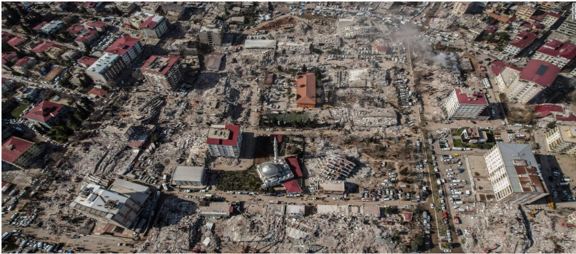
Aerial photo shows the damage done by the February earthquakes in Turkey and Syria

While the experiences of Syrian refugees are diverse and varied, the hardship of refugee status has not subsided for the hundreds of thousands of Syrians still displaced outside of their home nation. In recent years, humanitarian funding and resources have been reallocated due to the war in Ukraine, leaving many Syrians without the support they previously received from various governments and organizations. This hardship was then further exacerbated by the earthquakes that hit both Türkiye and Syria in early 2023, leaving a death toll of over 55,000 and thousands more injured or missing. 1 In addition to increasing unemployment and economic unrest across the Levantine and North African regions of the Middle East, Syrian refugees are not the only group struggling to find employment opportunities. 2 Despite the surge of resources allocated to meet the needs of those affected by the earthquake, this combination of factors has left a sizeable population of Syrian refugees without enough income to meet their most basic needs. 3