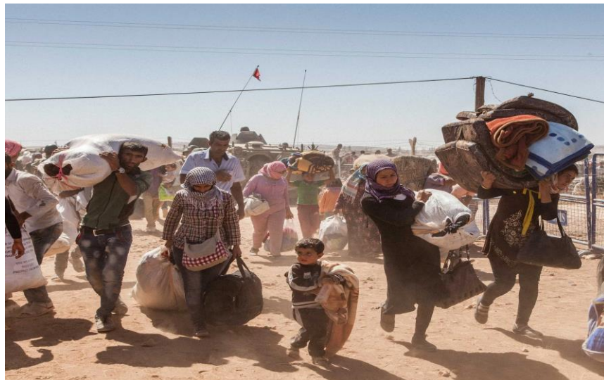
Syrian refugees cross the border into Turkey, 2014