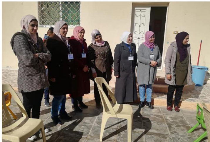
Syrian women serve as volunteers at a local NGO office in Mafraq, Jordan

This is why local organizations and partners are essential to administering aid. The impact that one small organization can have in a single community can be great. When an office closes because of a loss of funds, it has a negative impact on the community it served. And when this happens time and time again in cities all over the region, it has an adverse effect on the entire refugee population. The key to improving the condition of humanitarian aid to Syrian refugees is to partner with local organizations working for the long-term welfare of the Syrian people, both in and outside of Syria. In a 2022 advocacy letter to the Secretary General of the United Nations and the President of the United Nations General Assembly, thirty-nine Syrian humanitarian and NGOs called for equitable partnerships between donors, INGOs, the United Nations, and Syrian NGOs; increased aid with the purpose of capacity building for local organizations; an across the board effort to include Syrian people and organizations in decision-making about aid and policy; and funding for recovery and resilience programs geared towards the long-term success of Syrian families including projects to improve water and sanitation, housing, education, and cash and vouchers for livelihoods. 13