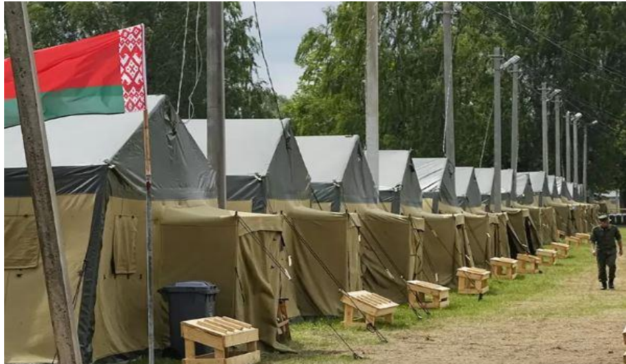
Photo of Wagner Group Tents in Belarus