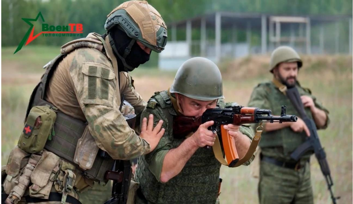
Wagner Group Forces train Belarussian Armed Forces - Photo Credit – Reuters.

Tensions on the eastern flank of NATO continue to rise following the movement of Wagner forces consisting of over 100 troops towards Suwalki Gap, a small area of land which lies in between Poland and Lithuania. The movement of thousands of Wagner troops to Belarus has come as a result of a deal between the mercenary group and the Russian government to end the armed rebellion that occurred in June. 1 Following this buildup of Wagner forces in the Suwalki Gap, the Polish Ministry of Defense released a statement on August first confirming a breach of Polish Airspace by helicopters marked with Belarusian flags in Bialowieza that was spotted by residents of the town. 2 At this time, the Belarusian Foreign Ministry denied any breach of Polish airspace conducted by Belarusian aircraft. Amid such provocations, the Polish Ministry of Defense has announced preparations for a buildup of Polish troops along the border.