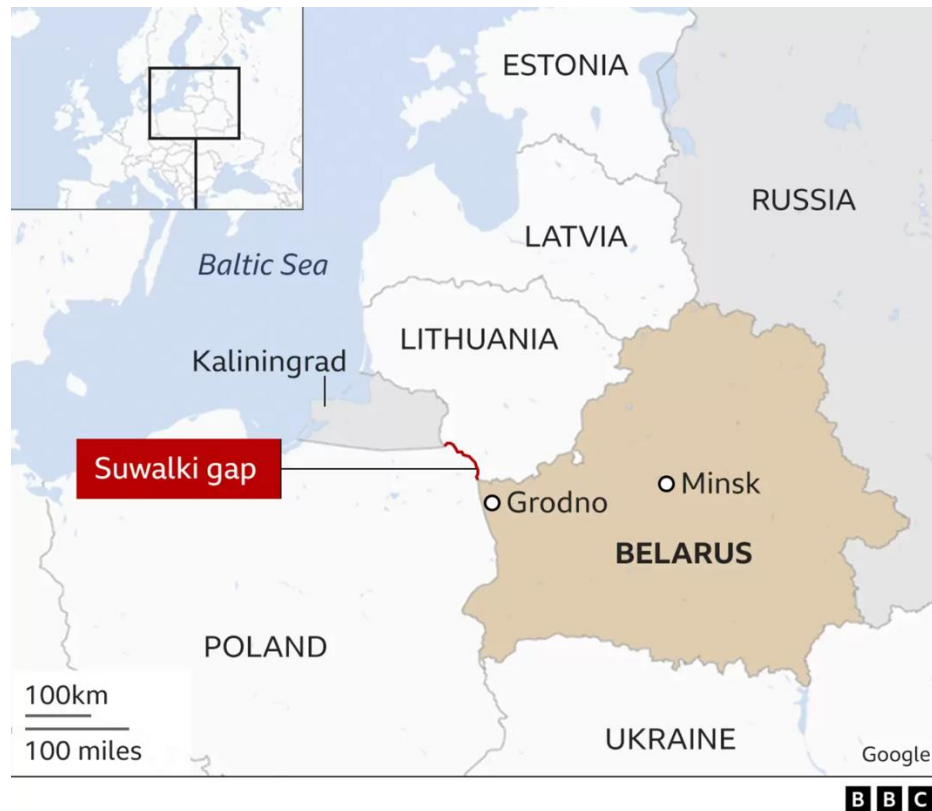
A map of the Suwalki Gap

The strategic importance of the Suwalki Gap is important to note in this scenario, as the area connects Lithuania, Latvia, and Estonia to the rest of the NATO alliance as well as separates Belarus from the Russian exclave of Kaliningrad. In the event of a seizure of the Suwalki Gap by Russia, then Lithuania, Latvia, and Estonia would be geographically cut off from the rest of their NATO allies. 3 Provocations near the gap have led to heightened concerns of a potential escalation. Polish Prime Minister Mateusz Morawiecki and Lithuanian President Gitanas Nausėda met to discuss security concerns over recent events. In the meeting, Morawiecki warned that “the number of provocations will rise,” calling for a reinforcement of Polish and Lithuanian troops along the borders in order to prepare for a potential escalation in the form of moving troops and helicopters to the border. 4