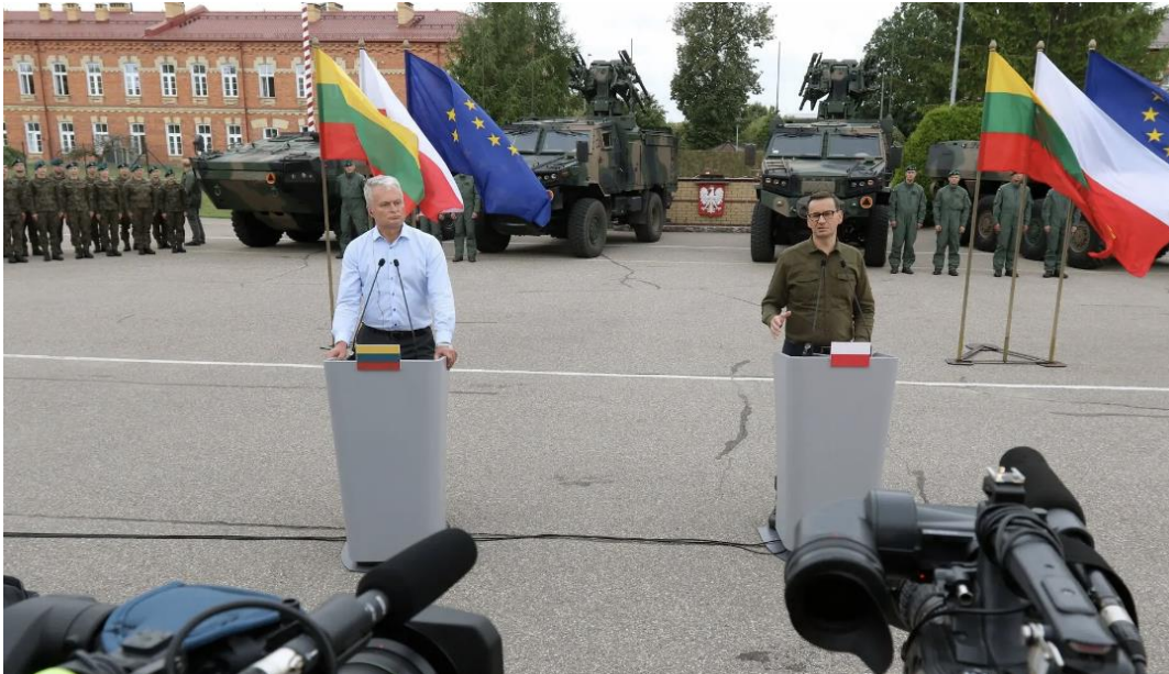
Nausėda (left) and Morawiecki (right) meet on August 3 rd in Northeastern Poland

heavy influx of migrants from Syria to Poland in what Polish officials claim to be an attempt at destabilizing the country in order to obtain a diplomatic advantage. 5 Through provocations such as those seen in early August along with the previous border crisis, Belarus and Russia could be attempting to test the limits of the West, causing concern over potential more dangerous provocations in the future. 6