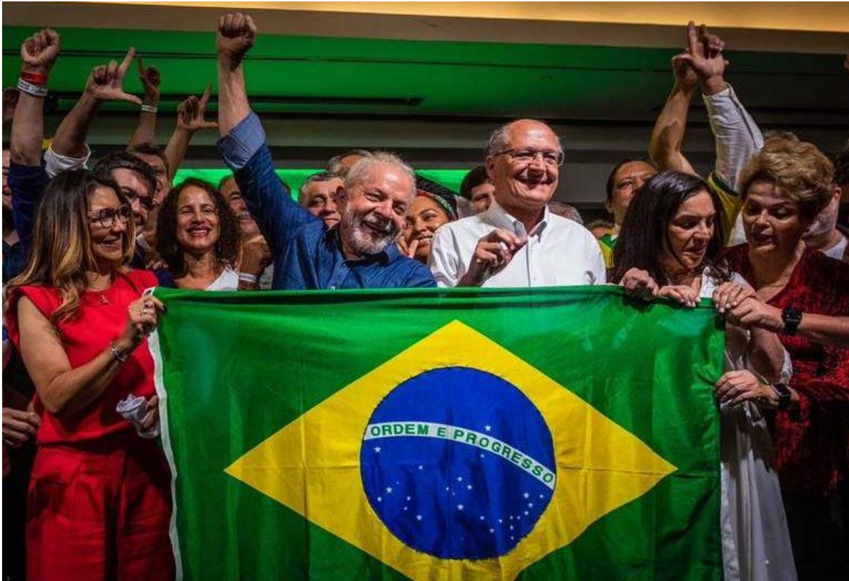
Lulu celebrates victory in Brazilian Elections 2022

The 2022 Brazilian Presidential elections concluded with the victory of former president Luiz Inácio Lula da Silva. However, he was sentenced for 12 years in prison for his involvement in the Operation Car Wash corruption scandal that rocked Brazil in 2014. Many view his conviction as a political “witch hunt.” In 2021, the Supreme Court annulled these charges, allowing Lula to run for president in the 2022 elections. 1 The electoral system in Brazil is a two-round system, like that used in France. To win, a candidate needs more than 50% of the popular vote to win the election. If no candidate receives such support, the top two candidates from the first round proceed