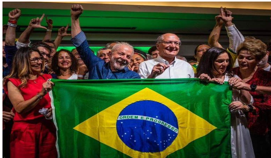
Lula celebrates victory in Brazilian Elections 2022

Sapna Suresh The America-Eurasia Center Americas Program www.EurasiaCenter.org