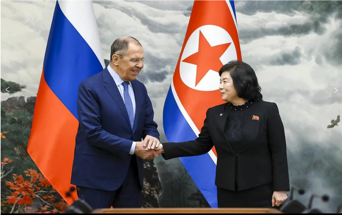
Russian Foreign Minister Sergey Lavrov and North Korean Foreign Minister Choe Son Hu shaking hands.

On September 19, 2023, Kevin Zhang published an amazing article for the Eurasia-America Center regarding a summit between North Korea and Russia. During this meeting, held on September 12, Vladimir Putin and Kim Jong-Un reaffirmed their cooperation with one another in light of the ongoing Russian invasion of Ukraine. North Korea had been providing artillery in exchange for acquiring knowledge on satellites. Aside from the obvious implications of two authoritarian nations forging closer relations, this terrified Western leaders. There are also numerous violations of UN agreements to consider. However, no official agreements or alliances were made between the two nations at this meeting. 1 “The emerging collaboration between these two nations presents a complex challenge for the United States now that it must deal with potential North Korean weapons on the Ukrainian front and a belligerent state armed with Russian technology in Asia-Pacific.” 2