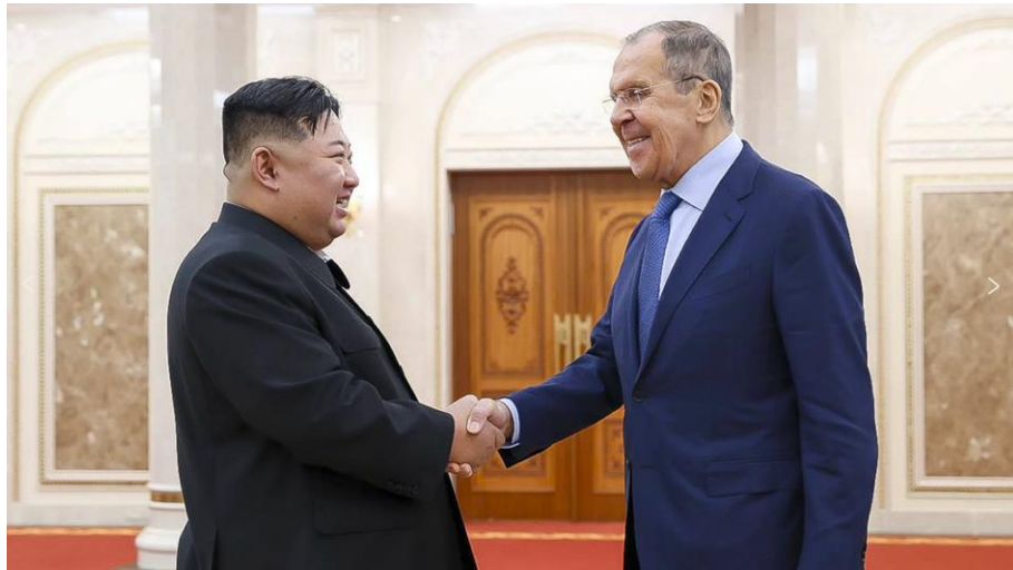
Meeting between North Korean dictator Kim Jong Un and Russian Foreign Minister Sergey Lavrov.

Nick Tocco The America-Eurasia Center East Asia Program International Security Program www.EurasiaCenter.org