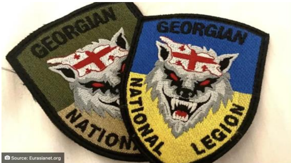
The patches worn by the Georgian Legion.