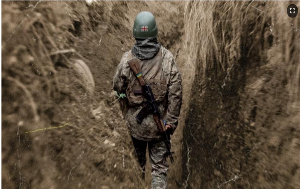
A Georgian fighter in Ukraine.

of the regiment. 11 The soldiers of the regiment wish to continue the revolutionary legacy for which they were named as some desire the violent removal of Lukashenko, although they acknowledge that the likelihood of this is highly unlikely without foreign assistance. 12 In the event the Kastuś Kalinoŭski Regiment is successful in freeing Belarus from tyranny, its members hope that Belarus will be able to join the European Union and NATO. The reason for this is the belief that the military technology and weaponry provided by NATO is essential to ensure the safety of smaller nations like Belarus. 13