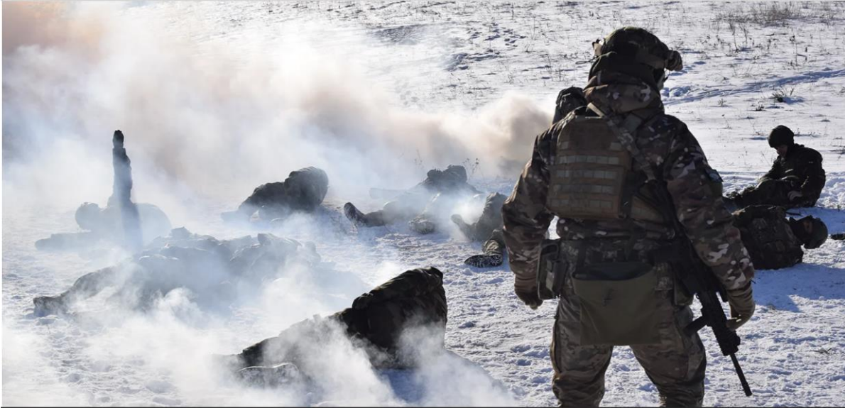
Members of the Kastus Kalinouski regiment practicing tourniquet tying.