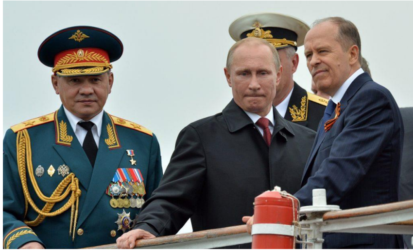
Putin with his inner circle, Defense Minister Sergei Shoigu and Alexander Bortnikov, Federal Security Service head.