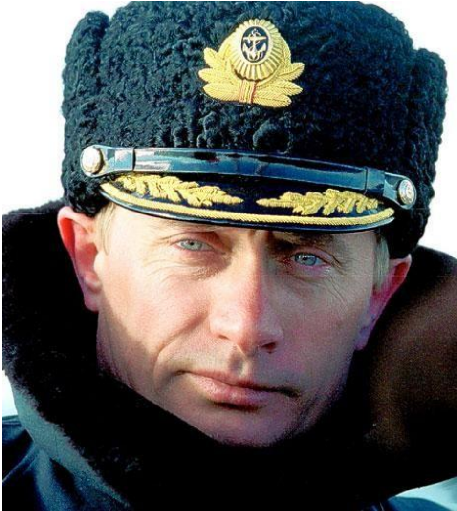
Putin dressed up while reviewing military maneuvers

Vladimir Putin has shaped the modern history and the future of the Russian Federation. In his 24 years in power, he shifted Russia from its post-Soviet path towards democracy to an authoritarian kleptocracy committed to destabilizing the liberal international order. Putin will be remembered as an autocratic dictator who could not stay in power without fear, corruption, and a cult of personality. His legacy will include his successful reduction of crime and Chechen terrorism, but more prominently, his legacy will be his brutal invasion of Ukraine, consolidation of power into autocracy, and repression of media, protestors, and opposition. His paranoia has helped to push more countries into NATO, and instead of securing Russian security, his aggression in Ukraine has made Russian security much more fragile.