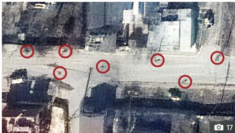
Satellite images show bodies of civilians lying on the 'road of death' in Bucha