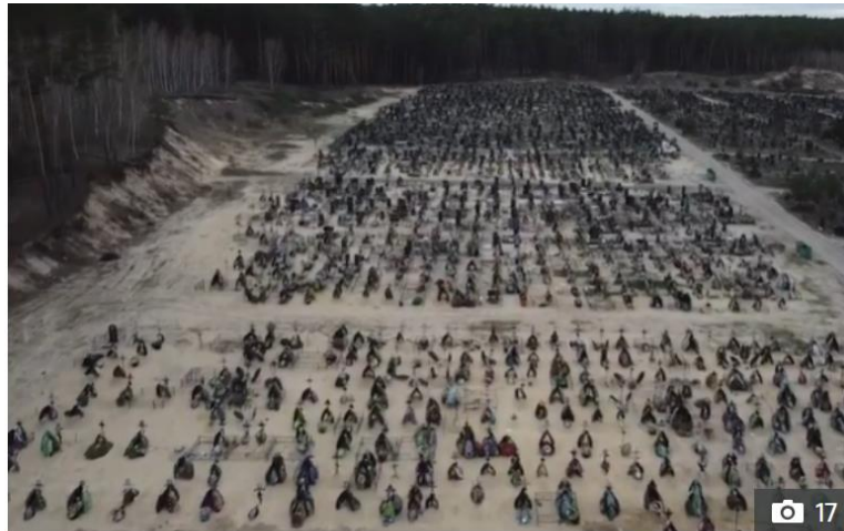
Mass graves outside Bucha built to bury the 458 killed by Russian troops