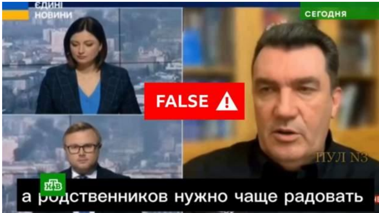
Deep fake photo of Ukrainians created in Russia to link Ukraine to Terrorists

Secretary of the National Security and Defense Council Oleksiy Danilov was aired. 15 Danilov appears to state that "It is fun in Moscow today. I think it's a lot of fun. I would like to believe that we will arrange such fun for them more often." 16 The video was crafted by splicing clips from previous interviews featuring him and using AI-generated audio to give the impression he was making a statement. 17