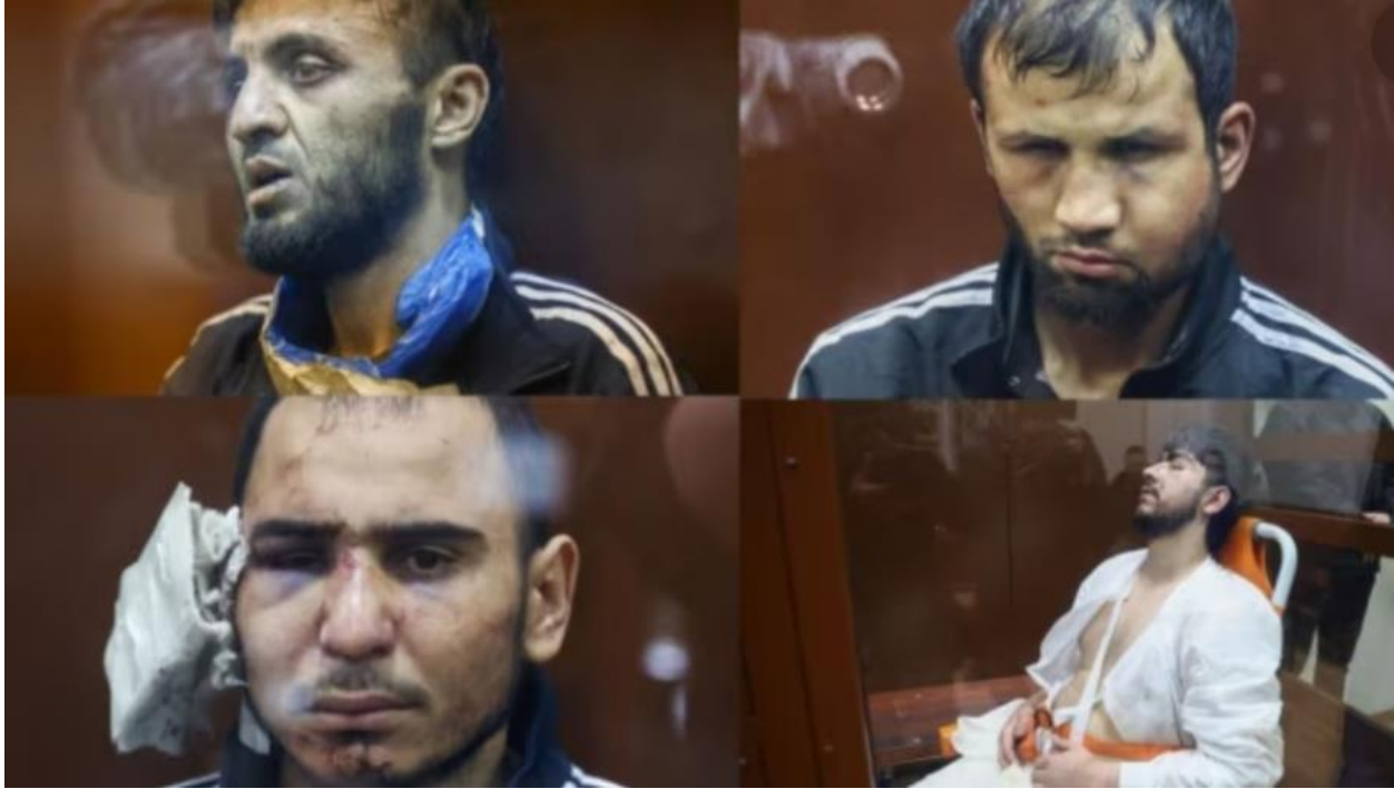
Images of the four captured terrorists facing justice in Russian Court

On Friday the 22 nd of March, a four-man team of terrorists stormed the Crocus City Hall in Moscow during a concert. The attack resulted in the deaths of 140 people and 360 wounded. 1 The city hall was also severely damaged as the militants used incendiary devices ultimately resulting in the collapse of the roof. After the attack, the ISIS branch in Afghanistan, also known as the Islamic State Khorasan Province or simply ISIS-K, claimed responsibility for the attack. 2 The Amaq News Agency, the news outlet linked to ISIS, published videos of the attackers firing directly into the crowds of people. 3