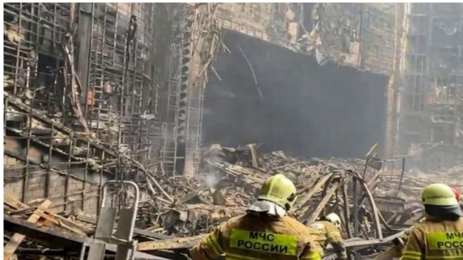
Crocus Concert Hall Moscow Destroyed by Terrorists