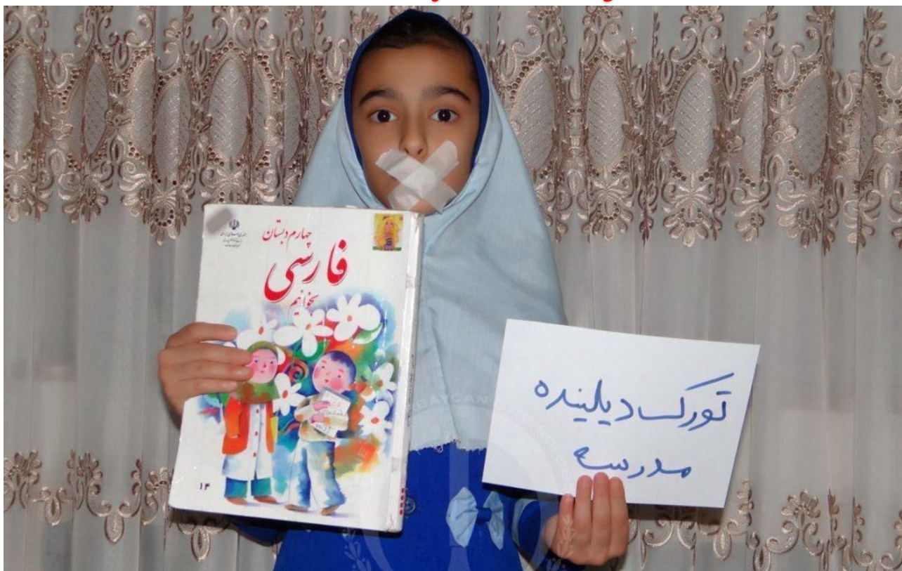
Youth ethnic Azerbaijani school girl in Iran's repressive education. "Where is education in my motherland?"