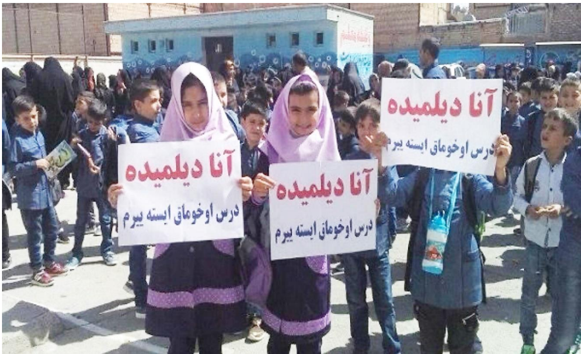
Azerbaijani school girls hold signs in Iran – “There should be schools in our mother tongue.”

opportunities for the Azerbaijani community. Grassroots movements and activism play a significant role in raising awareness about the issue and mobilizing the community to demand their linguistic rights. Legal challenges and litigation have also been pursued to challenge the discriminatory policies and seek legal redress. International support and solidarity have been crucial in advocating for the educational rights of Azerbaijanis in Iran and successful in putting pressure on the Iranian government to address this issue. Unfortunately, language educational rights violations extend to a number of other ethnic minorities in Iran and although it is difficult to obtain images on the Azerbaijani victims, Zara Mohammadi who was teaching Kurdish to her students below, was arrested and sentenced to ten years in prison.