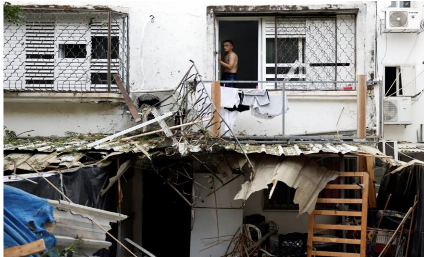
A man looks out into the rubble of a building in Ashkelon that was damaged by rockets fired by Hamas from Gaza

At 6:30 in the morning on October 7, 2023, Israelis woke up to alarms ushering them into bomb shelters and air raid shelters, ahead of thousands of incoming rockets launched by Hamas, the militant Islamist terrorist group that controls Gaza. By October 9th, the death toll had topped 1,500, with over 2,000 wounded on both the Israeli and Palestinian sides and continued to rise steadily. Hamas declared this attack, dubbed Al-Aqsa Storm, to be in response to the increase in Israeli provocations at Al-Aqsa Mosque, one of the holiest sites in Islam, and to Israeli violence over the past decades toward Palestinians. 1 In addition to the rocket attacks - Hamas claiming 5,000 rockets, the Israeli Defense Forces (IDF) saying 2,500 - Hamas also launched a sophisticated ground raid, using hundreds of guerillas against at least 22 locations in Israel, shocking Israel's vaunted intelligence services. 2 Innocent Israeli civilians as were killed while going about their daily lives, and even four days later, the death toll continues to grow as Israeli soldiers and their families grimly search for their loved ones. Children, women, the elderly, and men all have been victims of these egregious crimes. 3