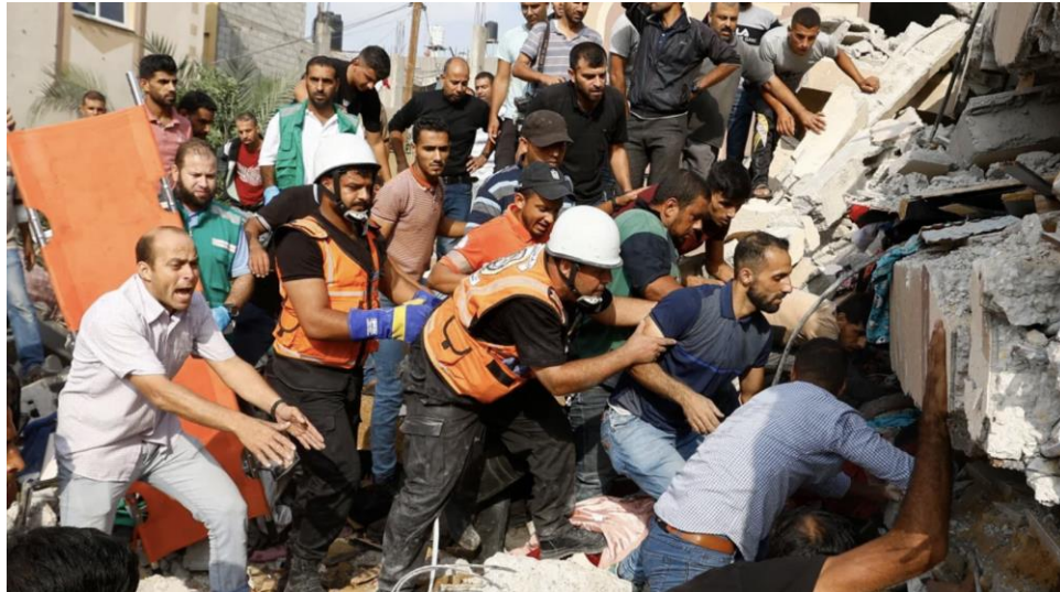
Palestinians search for victims under a house that was destroyed after an Israeli response attack in Khan Younis in the Gaza Strip

border; Israeli Defense Minister Yoav Gallant declared, "Nothing is allowed in or out. Without fuel, electricity, or food supplies, we fight animals in human form and proceed accordingly." 6 In addition to a blockage of supplies to Gaza, Israel Katz, Israeli infrastructure minister, tweeted that he had "ordered to immediately cut off the water supply from Israel to Gaza," along with fuel and electricity to more than 2 million Gazans. 7 Israelis and Palestinians now search for a safety that cannot be found, and in heart-wrenching uncertainty about how to proceed with this new normal.