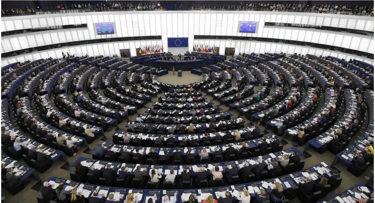
European Parliament Photo Credit AFP F Florin

Over 50 countries are set to hold elections this year, testing the strength of democratic institutions worldwide. 1 In Europe, the citizens of 27 countries will have the opportunity to vote for representatives in the European Parliament in June. Ever since its official creation in 1993, public perception of the European Union (EU) has varied, with certain parties framing themselves as pro or anti-EU. Euroscepticism, which broadly describes those who oppose integration in favor of increased sovereignty, has increased in popularity during the last decade. 2 Its manifestations vary from soft-Euroscepticism—where MEP's may take issue with very specific policies—to hard-Euroscepticism, in which representatives hold the view that their nation should completely exit the project.