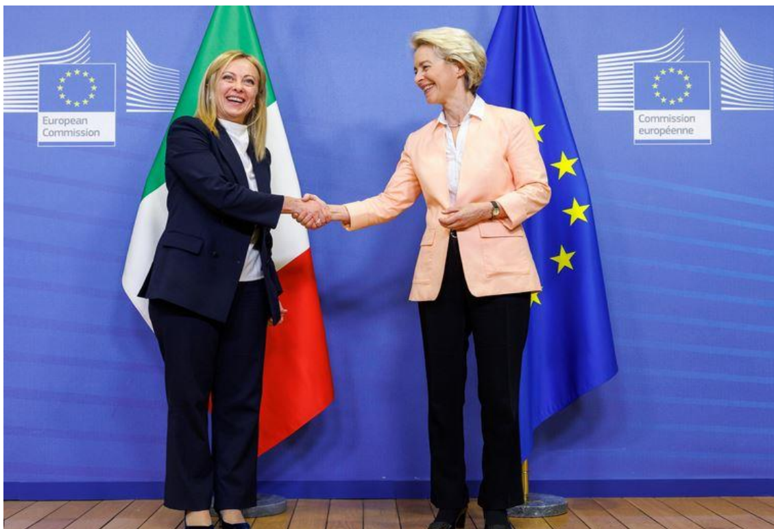
Italian Prime Minister Giorgia Meloni and EU President Ursula Der Leyen

The EU has seemingly been able to weather the Brexit storm. In fact, according to data from the Pew Research Center, most people, particularly those who live in EU states, have a positive view of the EU. 4 Regardless, Eurosceptic parties are expected to perform well in this year's election. The parliament's far-right party, Identity and Democracy (ID), is projected to become the third largest party, while the pro-European parties - the European Peoples Party (EPP), The Progressive Alliance of Socialists & Democrats (S&D), and Renew Europe (ALDE) - are expected to shrink. 5 The immigration crisis and talks of EU climate regulations have fanned the flames of anti-EU sentiment. 6 This forecast is consistent with developments in European domestic politics, as far-right nationalist parties exceed expectations in the polls and secure surprise victories in elections. In Germany, the far-right Eurosceptic Alternative for Germany (AfD) hit an all-time high in the polls in December of last year, 7 while Eurosceptic parties remain in power in Italy, Finland, Hungary, and the Netherlands.