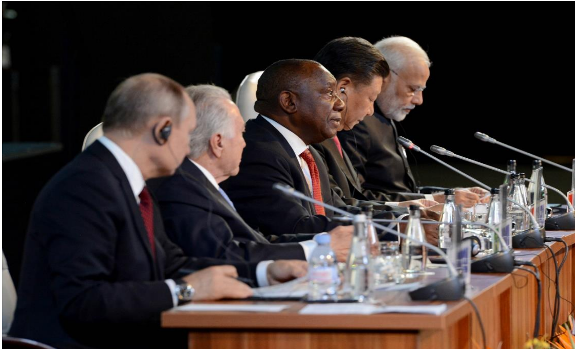
Leaders of the BRICS-countries during its summit in 2018.

In late August, South Africa hosted the fifteenth BRICS Summit in Johannesburg, Gauteng. 1 Along with the group’s other members—Brazil, Russia, India, and China—it announced its intentions to grant membership to six other states: Ethiopia, Egypt, Iran, Argentina, Saudi Arabia, and the United Arab Emirates—from an alleged group of 40 nations seeking membership. 2 At its core, the BRICS grouping is an economic one. The acronym “BRIC” was coined by the former chief economist of Goldman Sachs, Jim O’Neill, in 2001. At that time, the initial grouping of countries (excluding South Africa) had seen tremendous economic growth relative to the rest of the world. 3 Much like the G7, this casual grouping of nations had formed a more formal forum of cooperation and open dialogue between leaders.