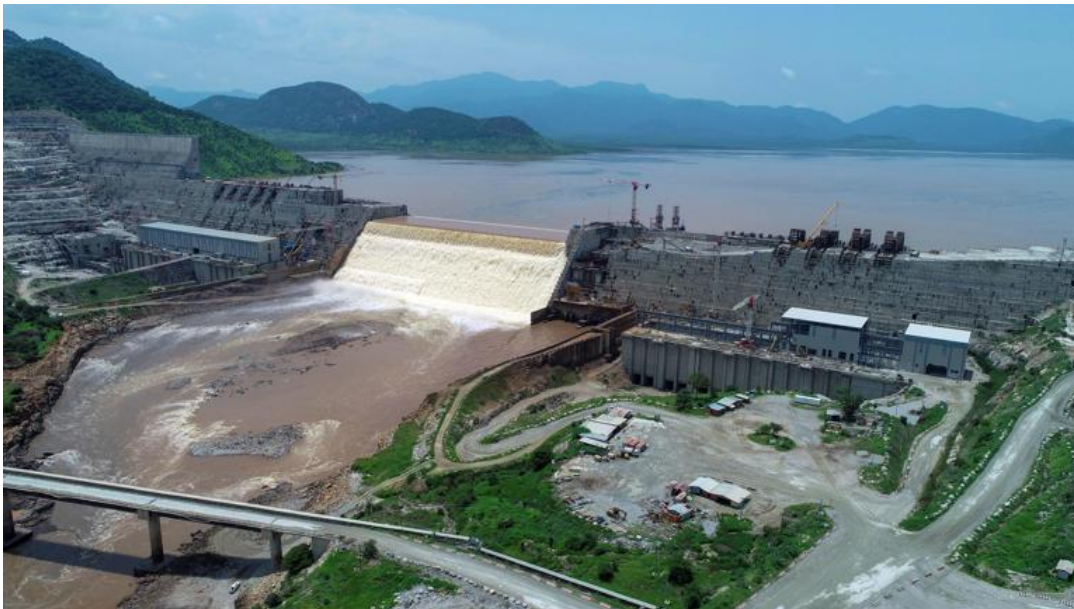
Grand Ethiopian Renaissance Dam.

As evidenced by the annual UN Climate Week held in New York City, as well as U.S. President Biden’s climate-focused appropriations in the Infrastructure Investment and Jobs Act (IIJA) of 2021, the global energy economy appears to be on the precipice of a major transition in the coming decades. Proponents of renewables and carbon emission cuts are eager to identify similar efforts and trends in the global east and south. The expansion of BRICS may yet be a move in this direction. Rystad Energy, an independent energy research and business intelligence company, released its findings that adding new members Saudi Arabia, Iran, United Arab Emirates (UAE), Egypt, Ethiopia and Argentina will transform the bloc into a leader in renewable energy due to its declining costs. “This appeal is reinforced by the abundant natural resources and affordable labor in most member countries.” 19 Despite this rather promising outlook, complexities in international tensions may arise due to an ongoing dispute between Ethiopia and Egypt in hydropower and river politics.