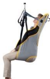
Sling e.g. USSK Loop