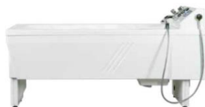
hi-lo bathtub iTub LENA