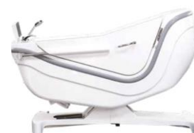
tilting bathtub SWING