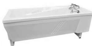
hi-lo bathtub LENA 100