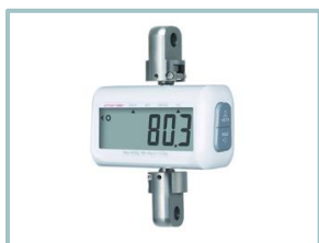
Optional: Calibratable Digital Scale