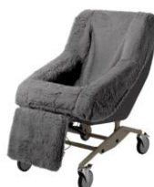
Recliner Cosy Chair