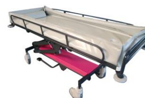
Shower trolley EDITION and more