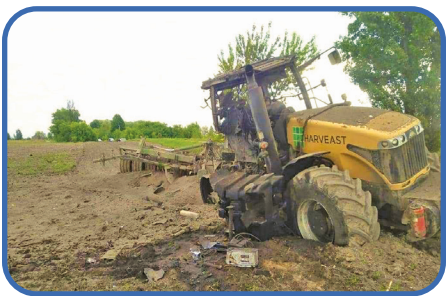
This year's sowing campaign is very unusual: Ukrainian farmers risk their lives to sow crops on the mined fields.