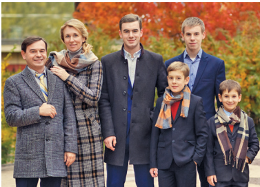
Translating the Bible into Ukrainian