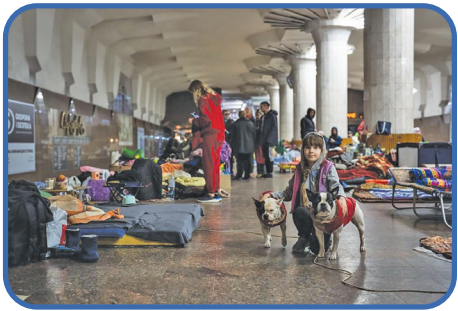
Living at train stations