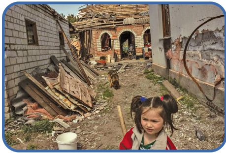
Children of war