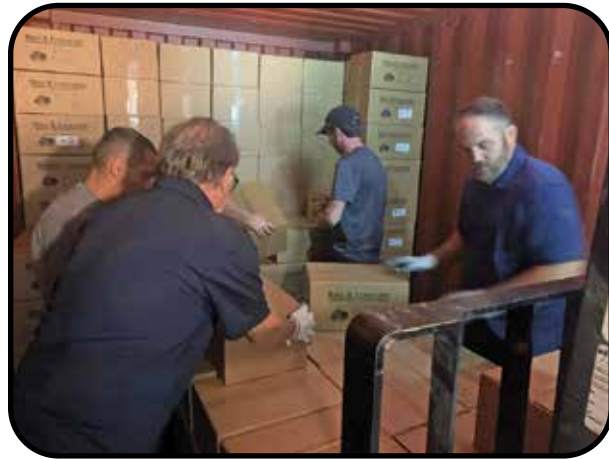
Ukrainian New Testaments to Poland

Since our November Prayer/Support letter was just mailed November 9th not a great deal has changed since then, and I will not receive a new distribution report from our secretary until after December 1. As of today, however we have printed 2,075,000 Scriptures, 400,000 of them whole Bibles, 1,285,000 New Testaments and 395,000 Bible portions with press runs of 75,000 Spanish New Testaments and 30,000 French Bibles on that press that should be finished this week.