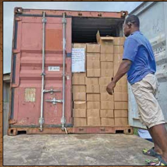
Scripture Arriving in Ghana

The great commission has three components, the written Word, which is the message (seed), the laborers (missionaries), and the Holy Spirit who does the convicting and the sealing! If a church is only sending laborers and not providing the written Word then they are only doing half their job, or in some cases doing