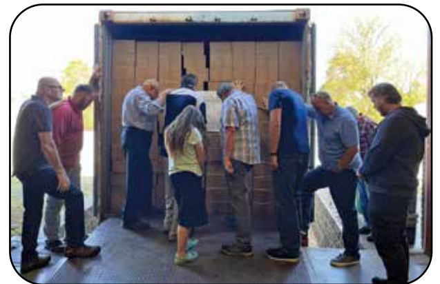
43,000 Scriptures to Togo, Africa

to be able to purchase at least 6 trailers a month. Before the 29% increase in the cost of paper we had hoped to by faith start purchasing 4 trailers a month and increase as we were able but at the PRODUCTION CONTINUED TO PAGE 4