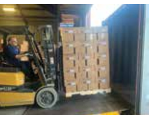
50,000 Headed to Kenya