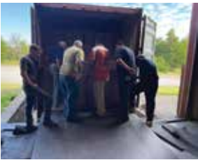
68,000 Scriptures for the Philippines