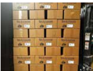
32,000 Whole Korean Bibles headed to South Korea