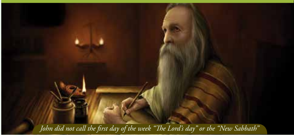
John did not call the first day of the week “The Lord’s day” or the “New Sabbath”