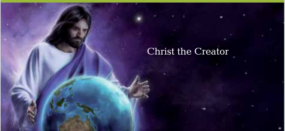
Christ the Creator

God must destroy sin someday because sin is destroying people. There is nothing that is more precious to God than people.