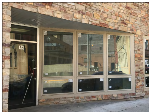
The exterior of the new campaign office was recently renovated with new windows.