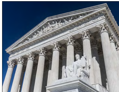
Six of nine Supreme Court justices voted in June 2022 to overturn Roe v. Wade, secure our Second Amendment rights and preserve our religious freedoms.

The Supreme Court overturned Roe v. Wade, secured our Second Amendment rights and preserved our religious freedoms. We belong to a party that represents life, liberty and the unashamed pursuit of God. As we gain strength, we must not let up. We must press further into the values and convictions we possess as Republicans.