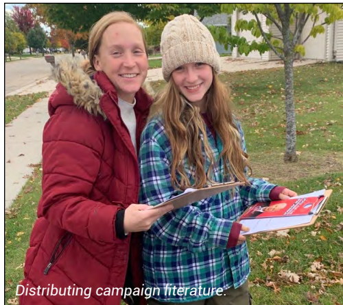
Distributing campaign literature.