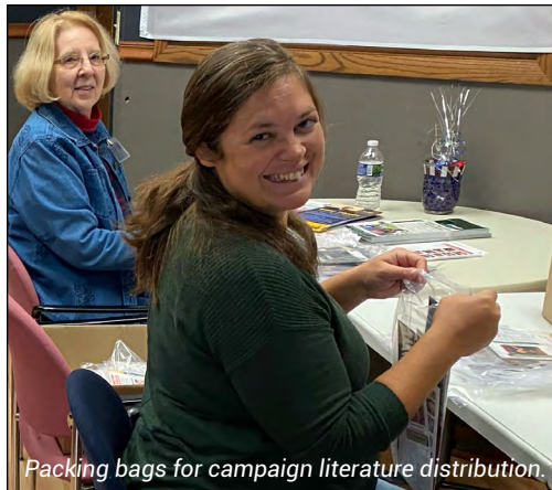
Packing bags for campaign literature distribution.

Six months ago, it seemed as if the role of the chairman was to field phone calls and emails from disgruntled Republicans. I am glad this is no longer the case, but what is in its place is a gift beyond words. The phone calls and emails now come from men and women with grateful hearts who want to help. I think it is safe to say that I have worked with hundreds of volunteers this summer. It might be impossible to connect with every person to extend my thanks and gratitude, yet this article attempts to do that.