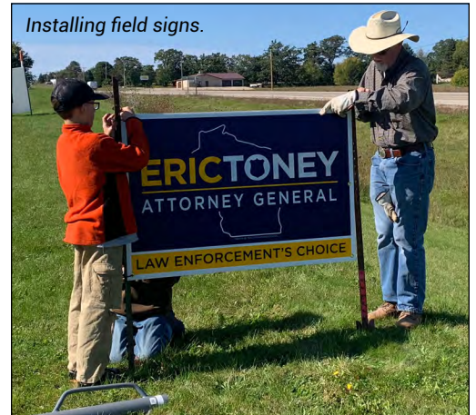
Installing field signs.

Thank you for giving your time, your talent and your treasure. The work of a healthy county party is not the work of one man and his leadership, it is in the thousands of selfless acts of service of its members.