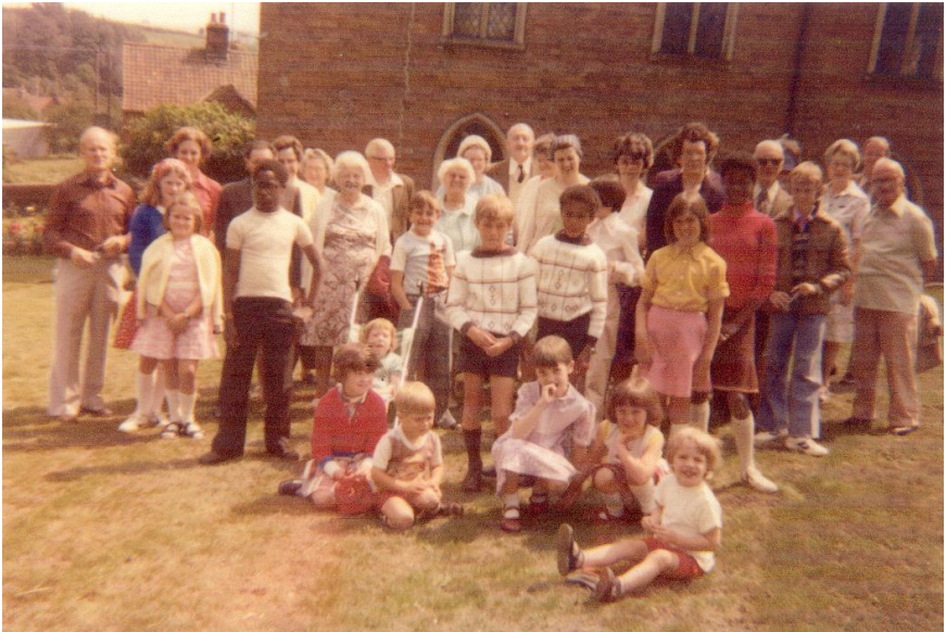
Taken before the coach set off on the 1977 outing.