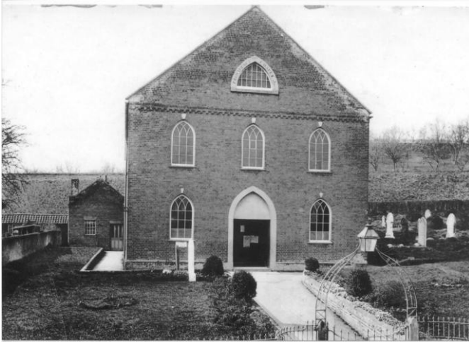
Penknapp Pre 1924