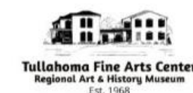
Exhibit Hall: A