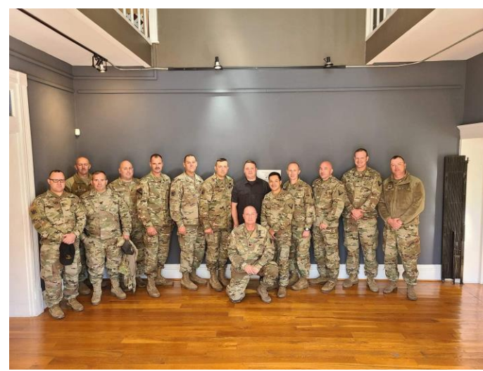
Tennessee Army National Guard visits TFAC