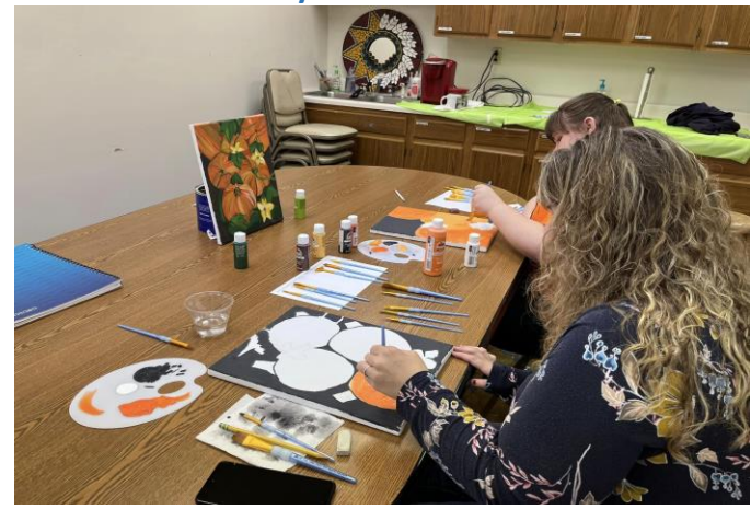
Seasonal Painting Classes at TFAC

The visit included a tour of our facilities: TFAC Members Gallery and our array of exhibitions. TDTD is excited about the increased number of visitors that our organization has seen over the past few months! Our programs and initiatives are significant to the welfare of our community, economy and tourism!