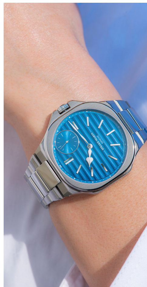
Speake Marin - Ripples Bleu Royal (Unique piece)