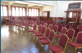
Walker Suite & Many More