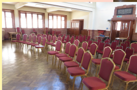
WALKER SUITE & MANY MORE