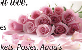
Table Decorations & so much more....