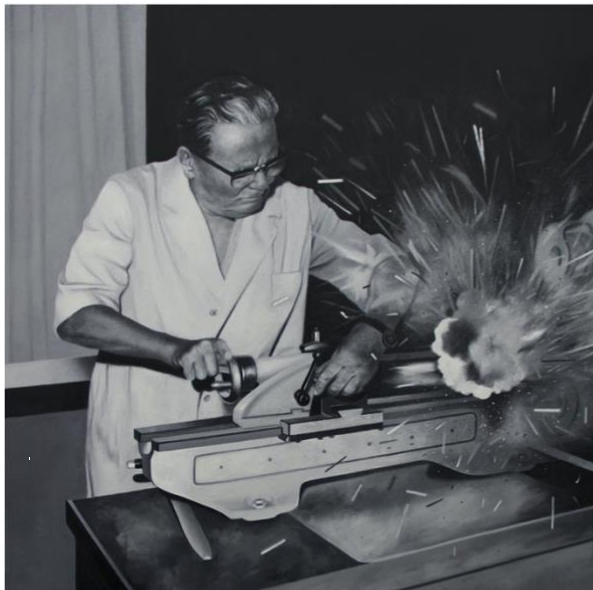
State Control oil on canvas, 50×50 cm, 2022