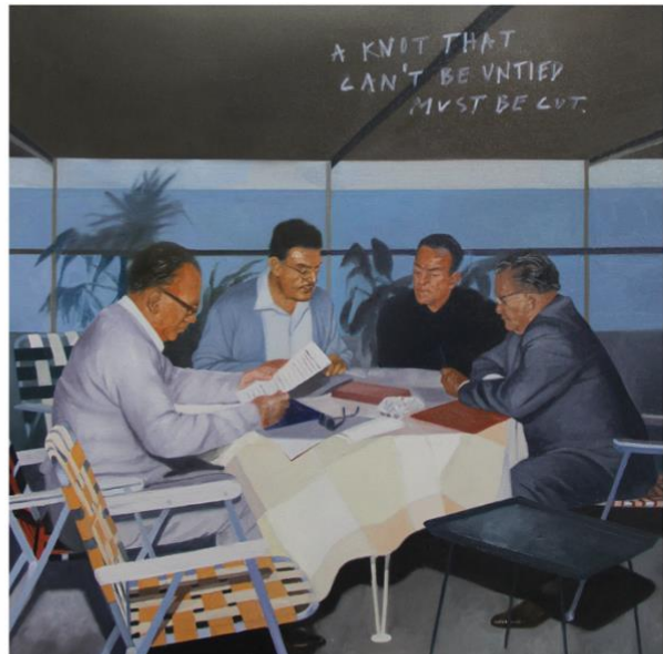
All Hands on Deck oil on canvas, 50×50 cm, 2022