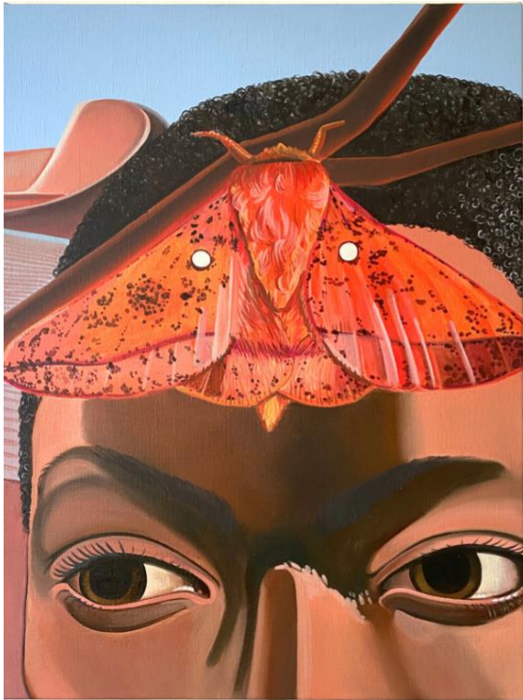
'Umwelten Gap (Oakworm Moth)'