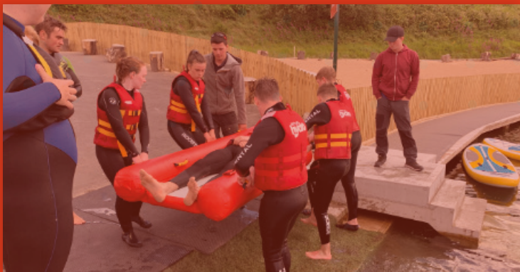
Open Water Spinal Extraction