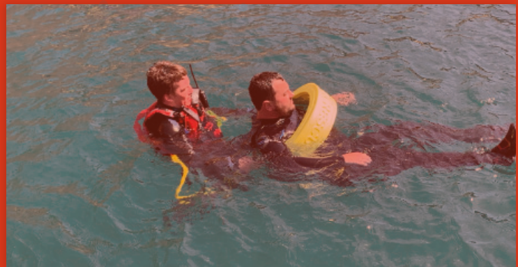
Deep Water Rescue Intervention