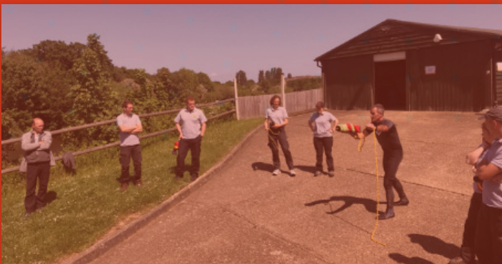
Park Rangers Rescue Training