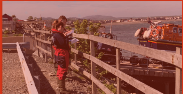
Environmental Scientists, Planning Water Samples