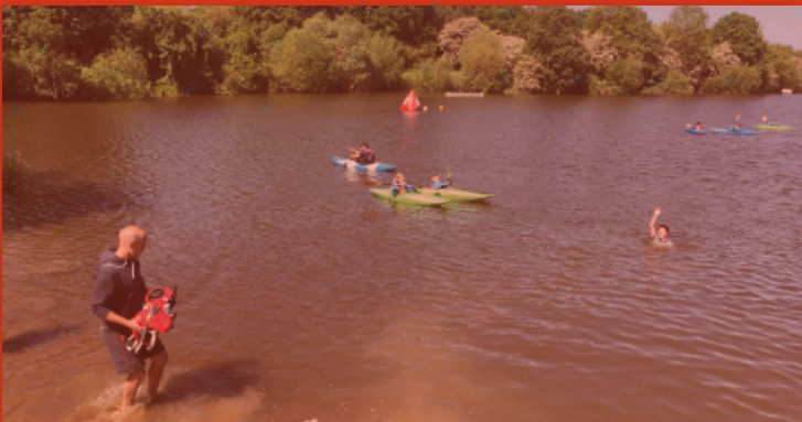
Outdoor Activity Leaders, Managing Water Activities