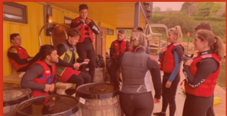
Outdoor Education Providers, Planning