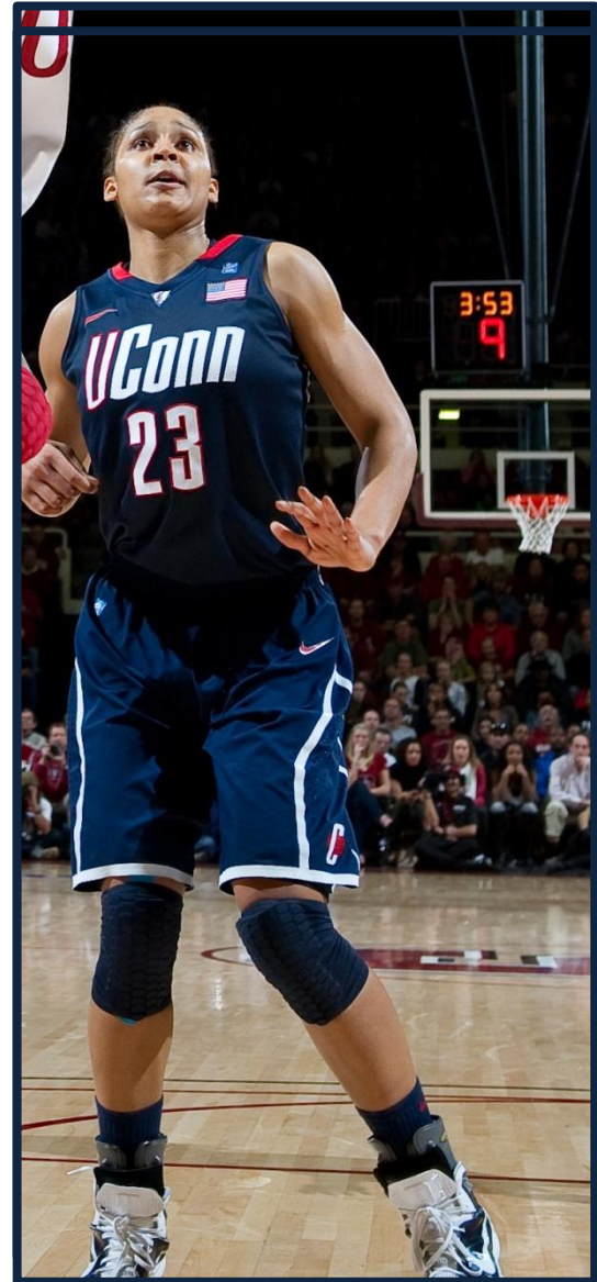
In 2011, Maya Moore concluded her stellar career at UCONN.

While the president's pick for the NCAA title fell short (UConn was eliminated in the semifinals), Moore was drafted at the conclusion of the tournament, and she went on to help her team, the Minnesota Lynx, beat the Atlanta Dream for the franchise's first WNBA title, sweeping the best-of-five series 3-0.