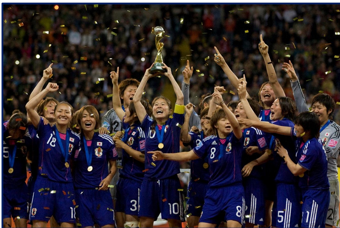
Japanese captain Homare Sawa (10) raises the trophy and celebrates with her teammates following the final of the FIFA Women's World Cup at FIFA Women's World Cup Stadium in Frankfurt Germany. Japan won the FIFA Women's World Cup on penalty kicks after tying the United States, 2-2, in extra time.

This is the biggest issue with women's sports. Women's World Cup happens every four years, and every four years there are the summer Olympic Games. But with women's pro soccer unable to gain a foothold in this country, the ability to create a passionate, sustainable fan base seems out of reach. So what works for us, is we have a dedicated group of young women willing to give it their all for a piece of the national spotlight during these international events; what works against us is our inability to sustain professional options in women's athletics.