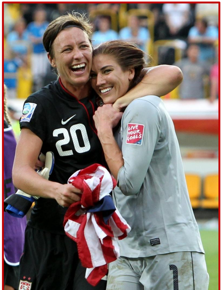
Abby Wambach and Hope Solo of team USA celebrate after defeating Brazil in the FIFA Women's World Cup Quarterfinals at the FIFA Stadium in Dresden, Germany on July 10th, 2011.

This year's team sought to create its own destiny and move out of the shadow of the '99ers.