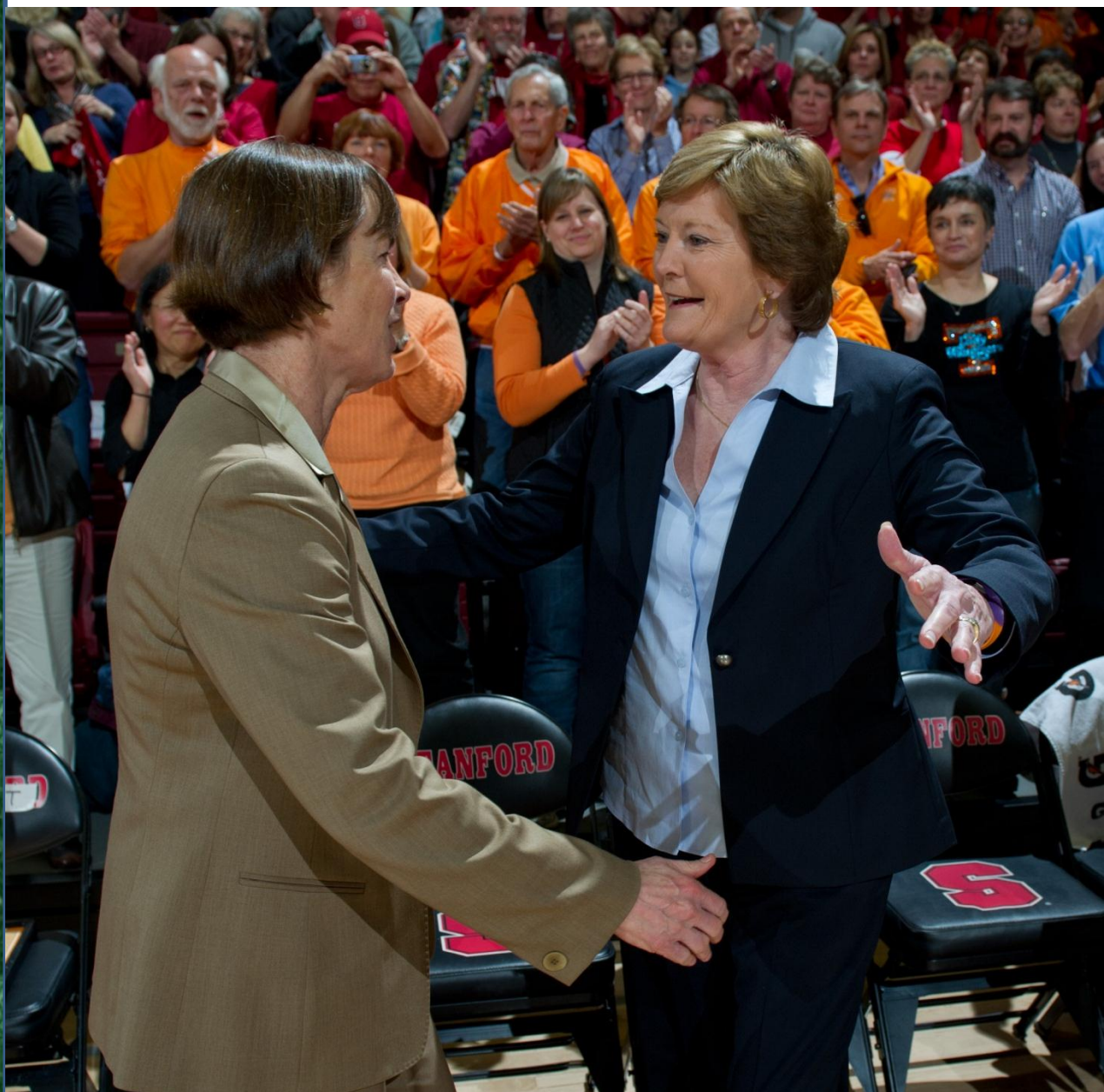
Tara VanDerveer greets Pat Summit before the Stanford women's basketball team beat Tennessee 97-80 at Maples Pavilion on December 20, 2011.