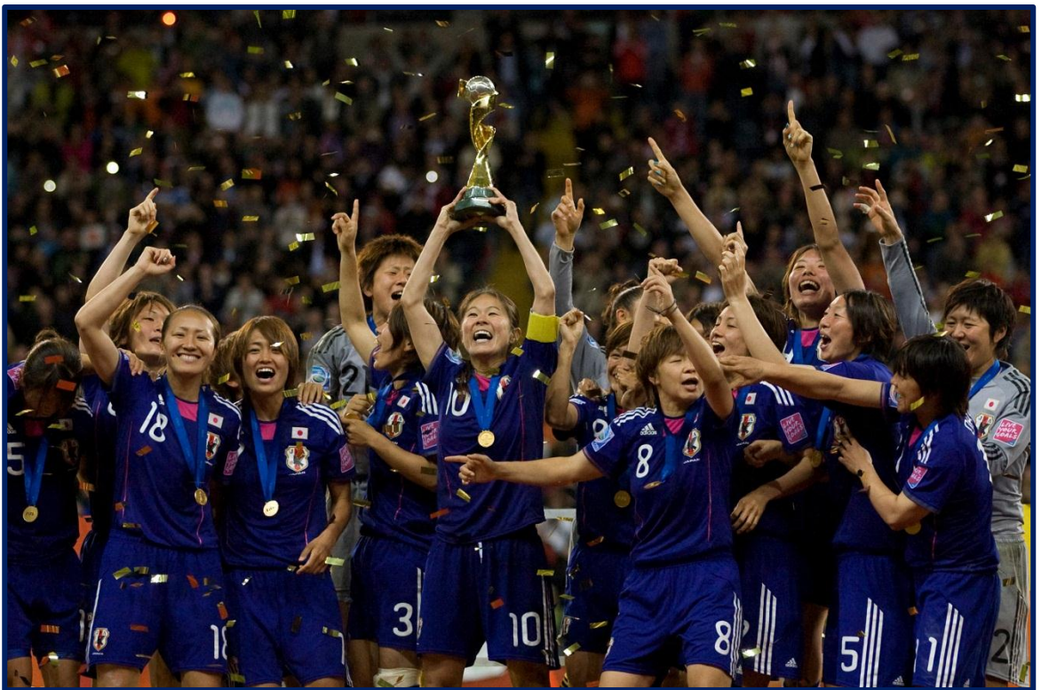
Japanese captain Homare Sawa (10) raises the trophy and celebrates with her teammates following the final of the FIFA Women's World Cup at FIFA Women's World Cup Stadium in Frankfurt Germany. Japan won the FIFA Women's World Cup on penalty kicks after tying the United States, 2-2, in extra time.

This is the biggest issue with women's sports. Women's World Cup happens every four years, and every four years there are the summer Olympic Games. But with women's pro soccer unable to gain a foothold in this country, the ability to create a passionate, sustainable fan base seems out of reach. So what works for us, is we have a dedicated group of young women willing to give it their all for a piece of the national spotlight during these international events; what works against us is our inability to sustain professional options in women's athletics.