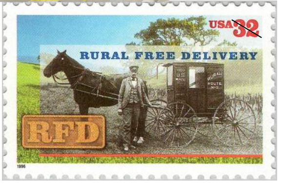
USA #3090 from 1996

A similar rural mail c a r r i e r carriage is shown on USA #3090 from 1996.