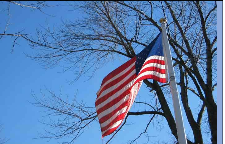
John R. Vincenti Tower of Remembrance: Tribute to those who died on September 11, 2001

Sources: https://www.hmdb.org/marker.asp?marker=19591 , https://www.mycentraljersey.com/story/news/local/how-we-live/purpose/2017/09/09/remembering-9-11-events-central-jersey/630563001/ , https://njmonthly.com/articles/jersey-living/jerseys-911-memorials/ , https://www.shrineofsaintjoseph.com/campus/ , and https://www.flickr.com/photos/tags/stirling911memorial .