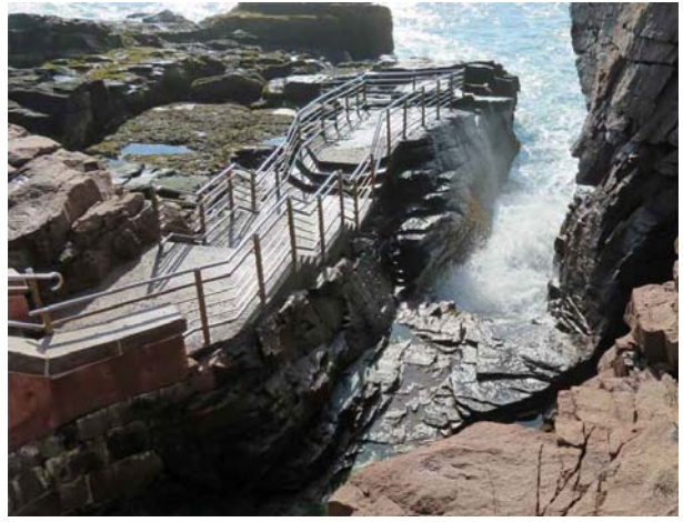
A video of Park Loop Road & Thunder Hole at