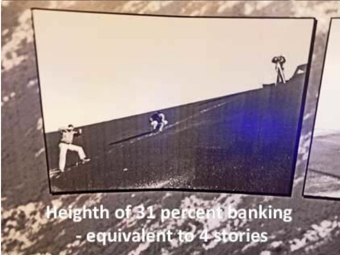
Height of 31 percent banking - equivalent to 4 stories