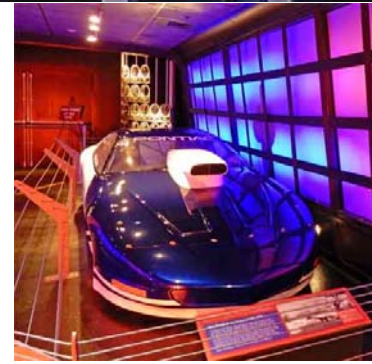
Some of the Hall of Fame Inductees since 1989