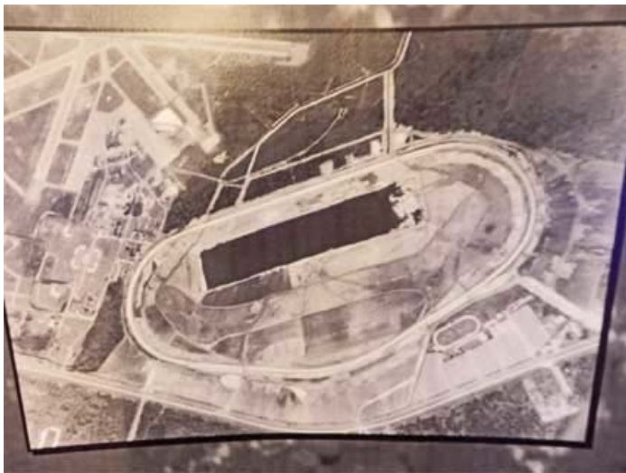
Track Construction began 1957