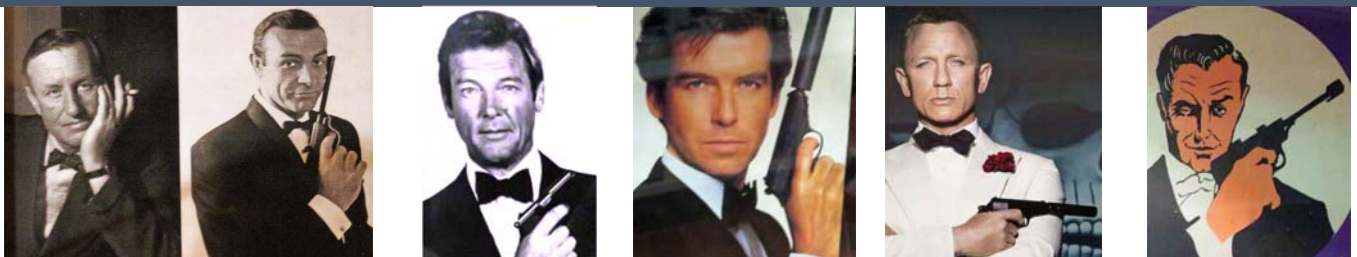
Left to Right above: Ian Fleming, Sean Connery, Roger Moore, Pierce Brosnan and Daniel Craig. The last one was on a 007 game box cover.