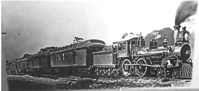
First train arriving in Miami, 1896