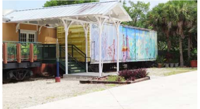
Museum's Railroad Historical Artifacts inside the sheds and outside