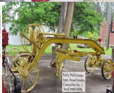
Early Pull Grader type, Road Grader, Caterpillar No. 3 Built 1925-1928.