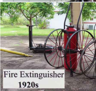
Fire Extinguisher 1920s