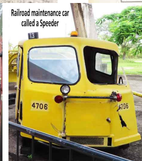
Railroad maintenance car called a Speeder