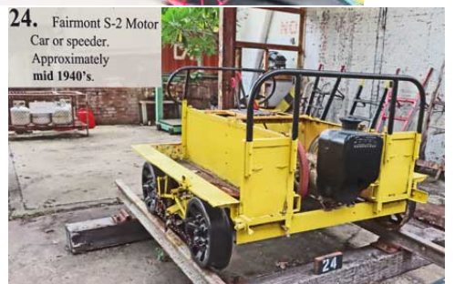
24. Fairmont S-2 Motor Car or speeder. Approximately mid 1940's.