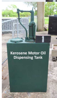
Kerosene Motor Oil Dispensing Tank

The American LaFrance Fire Truck was donated to the museum in the late 1980's. It is currently not operational but on display for visitor viewing.