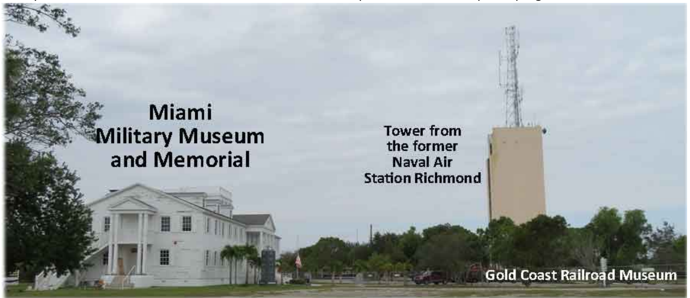
Gold Coast Railroad Museum area

Unfortunately, when the photo program photography was done, the Gold Coast Railroad Museum and Miami Military Museum and Memorial were closed. Zoo Miami was open and has its own photo program.