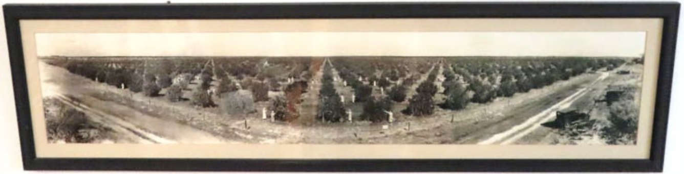
Above photo of orange groves and workers-1930 in the museum