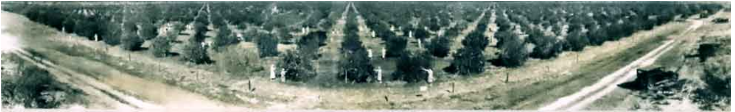
Below colorized version

Flamingo Gardens 3750 South Flamingo Road Davie, FL 33330-1614 (954) 473-2955