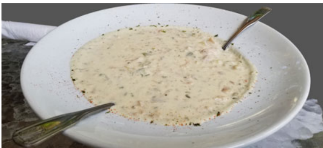
Some of the meals enjoyed at Crawdaddy's