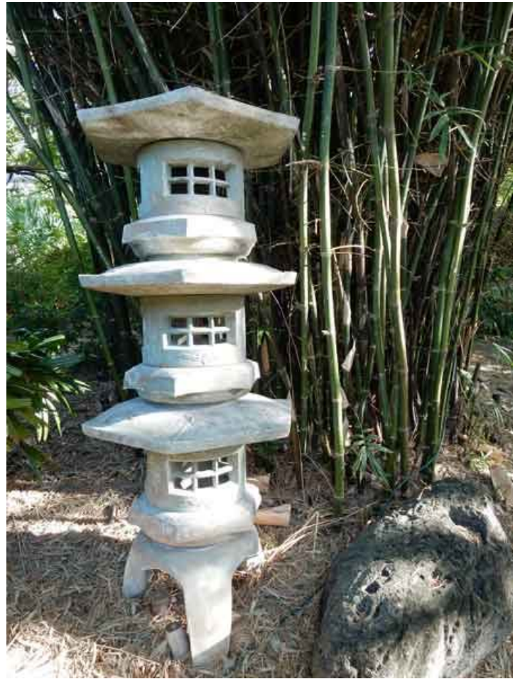
Miami Beach Botanical Garden