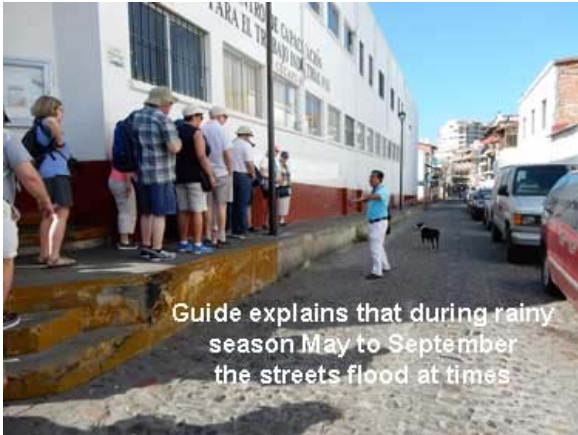
Guide explains that during rainy season May to September the streets flood at times