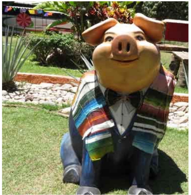
On the way back from Rio Bendito, we took another route and viewed a different part of the city.