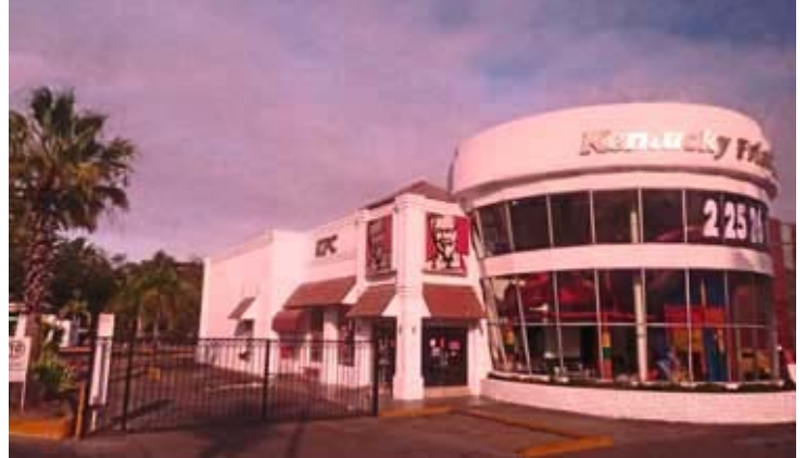
The next part of our tour was to leave the city and travel into the countryside. The change was evident as we left an urban setting into a rural and a poorer economic lifestyle. Our guide discussed education and living issues facing the residents.