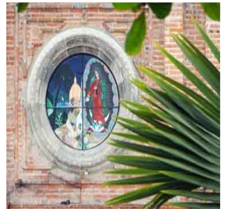
A tour of the city of Puerto Vallarta