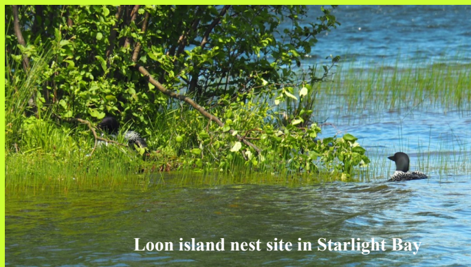
Loon island nest site in Starlight Bay

Starlight bay pair—matches record of leg band color...female left leg blue over red white stripe...male right leg orange over silver