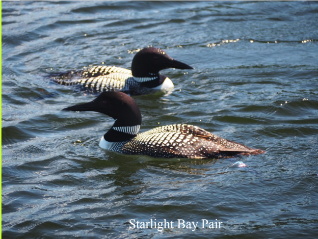
Starlight Bay Pair