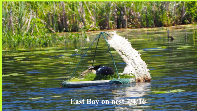
East Bay on nest 7/4/16

All 4 nest sites produced again this year, but it has been bad news since the hatching. Starlight bay pair had one chick and we have not seen it for a week. West Bay pair had two and we have only seen one for some time now. West Plum lake produced a pair as well and we think they are safe so far. Our East Bay pair got on the nest just about a month ago and as of yesterday, are still on it.