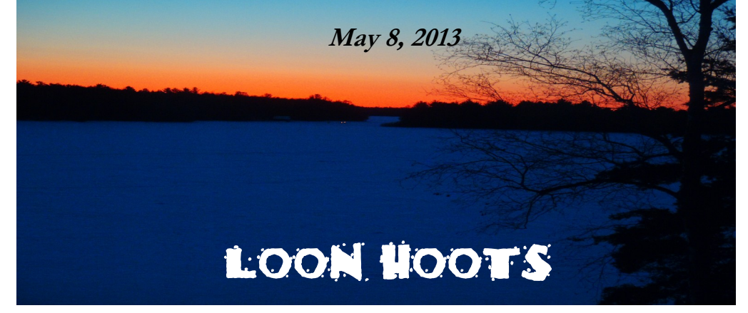
The Newsletter of Plum Lake Association