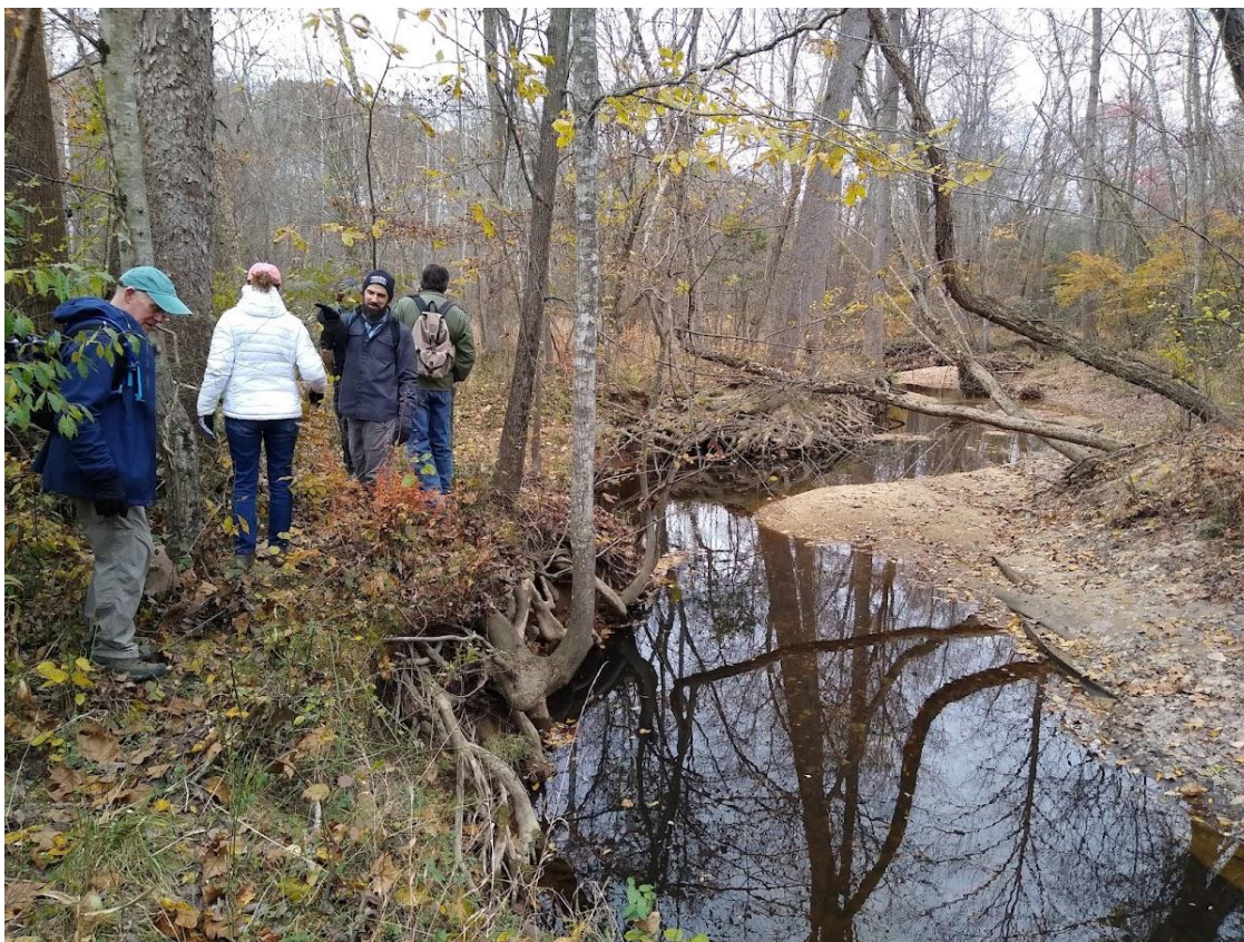
Social trail up ride towards Nightfall Court: