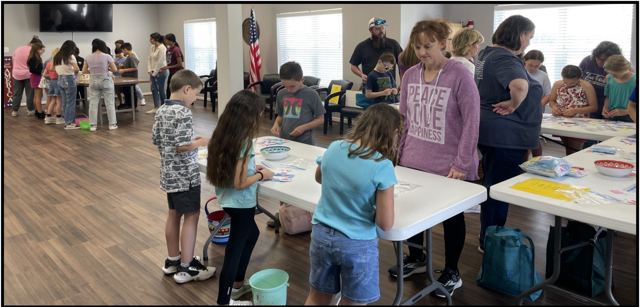
Craft time at the Community Easter Egg Hunt