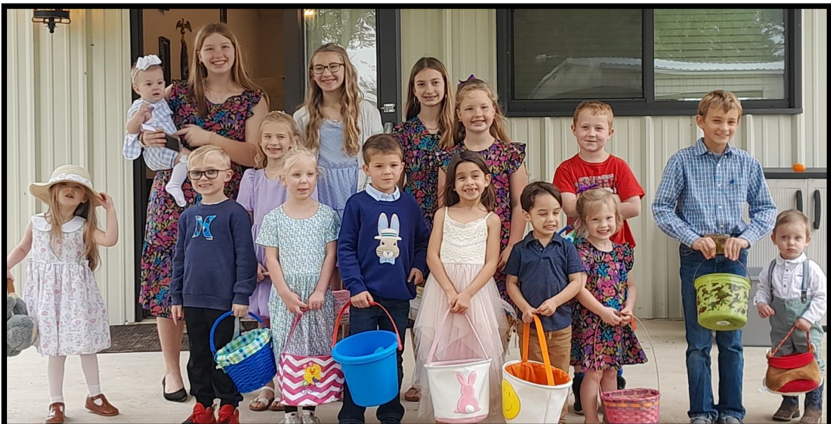
The Children are ready for the Welcome Lutheran Church Easter Egg Hunt.