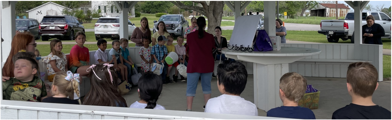
Story Time at the Community Easter Egg Hunt Saturday, March 30